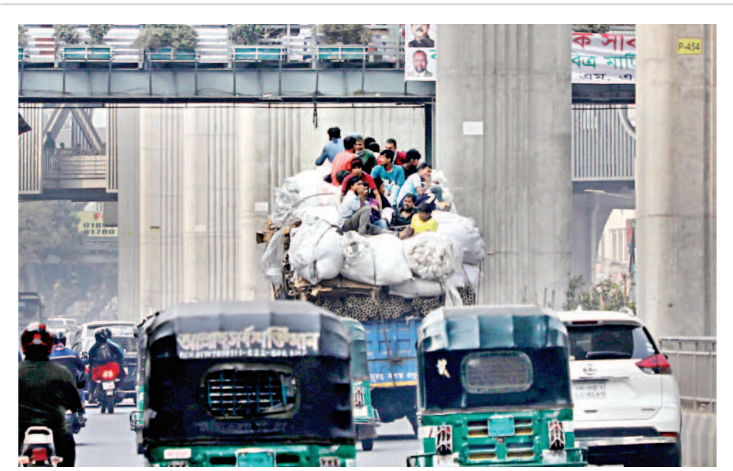
A group of people sits on top of goods loaded on a truck in the capital's Farmgate area yesterday. Such an action not only jeopardises their lives, but also puts others in harm's way.

Due to the cold wave and dense fog, flights and inland road communication have been delayed over the last few weeks.