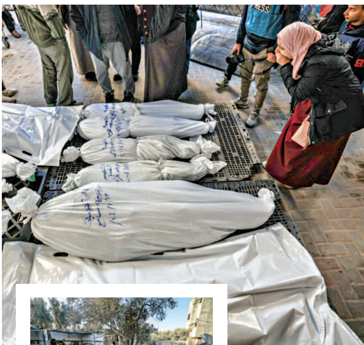
A Palestinian woman mourns over the bodies of victims of Israeli bombardment in Rafah in the southern Gaza Strip yesterday. Inset, People inspect the rubble of a building following an Israeli strike in Rafah.