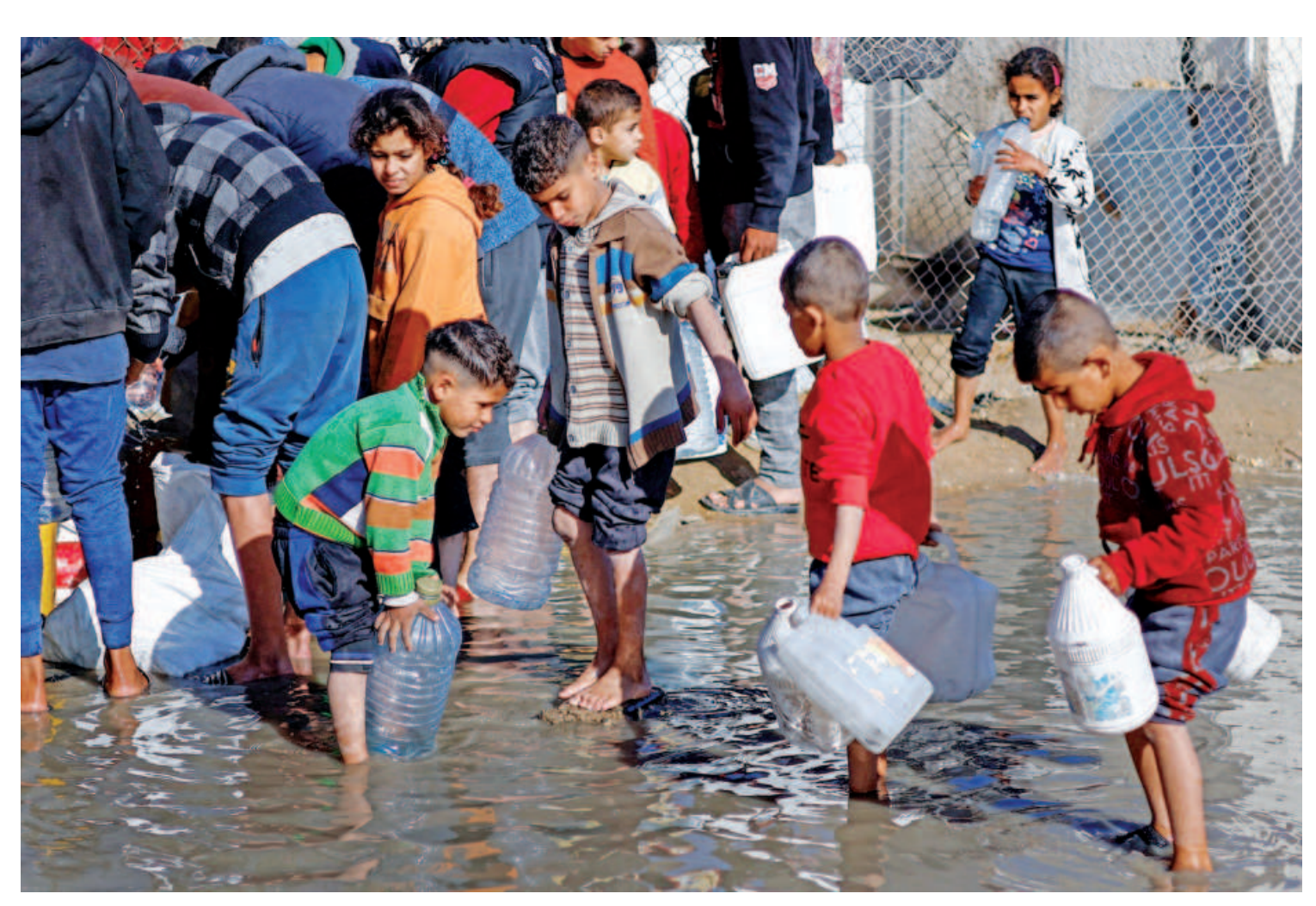
Children waddle through a puddle to fill bottles with water as displaced Palestinians, who fled their houses due to Israeli strikes, shelter at a tent camp in Rafah in the southern Gaza Strip yesterday.