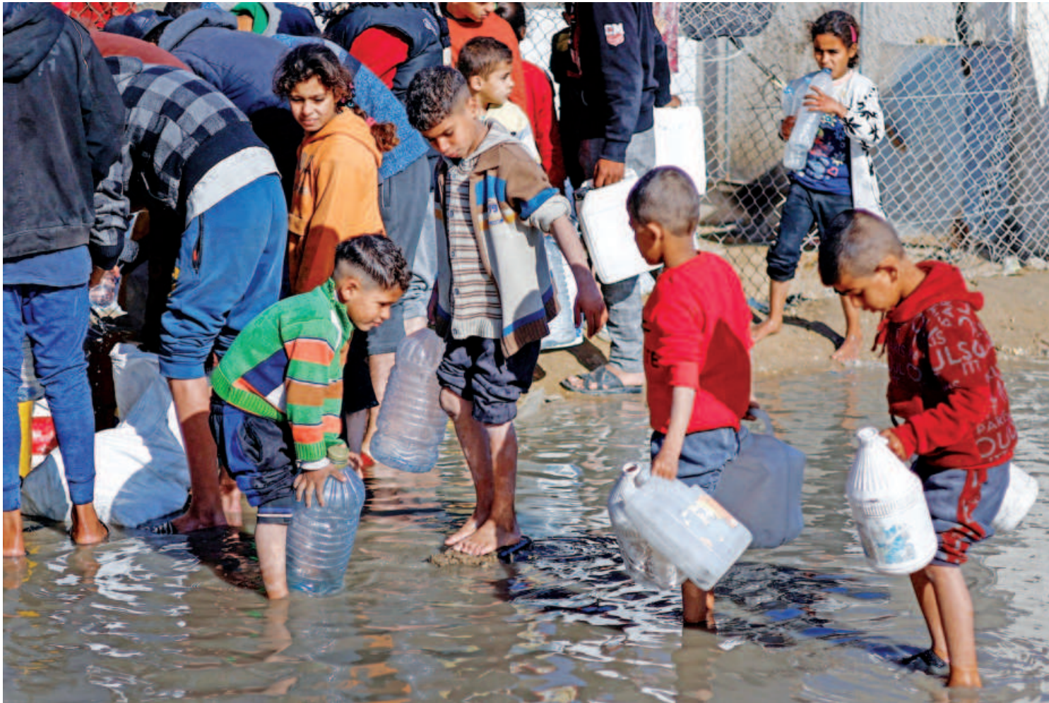
Children waddle through a puddle to fill bottles with water as displaced Palestinians, who fled their houses due to Israeli strikes, shelter at a tent camp in Rafah in the southern Gaza Strip yesterday.

REUTERS, New Delhi The Indian Navy said yesterday it had rescued the crew of a US-owned vessel in the Gulf of Aden after an attack by Yemen's Houthi movement as tensions in the region's sea lanes disrupted global trade. Following the attack on US Genco Picardy late on Wednesday, US military said its forces had conducted strikes on 14 Houthi missiles that "presented an imminent threat to merchant vessels and US Navy ships in the region". India said it diverted a warship deployed in the region to rescue the 22 crew on board the Genco Picardy, including nine Indians. The crew were all safe and a fire on board the vessel had been extinguished. The Houthi said its missiles had made a "direct hit" on the bulk carrier.