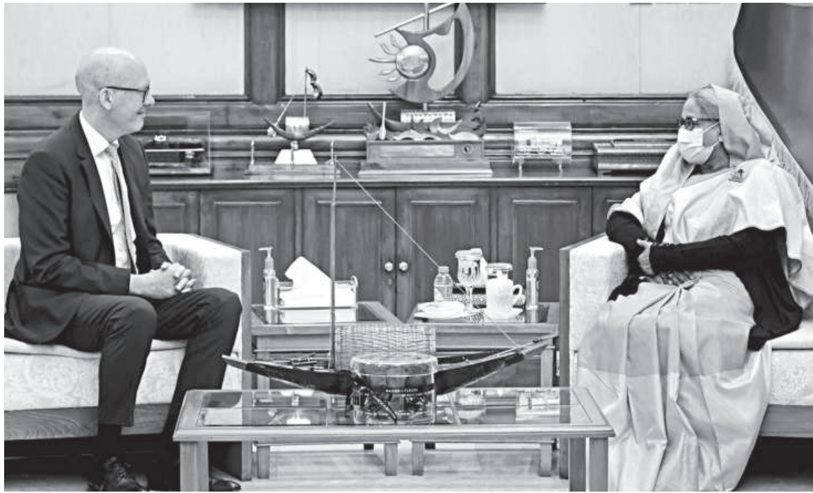
EU Ambassador Charles Whiteley pays a courtesy call on Prime Minister Sheikh Hasina at Gono Bhaban yesterday morning.