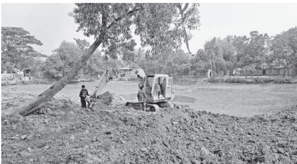
The field in the photo used to be a 50-year-old pond in Brahmanbaria's Bijoyagar upazila a couple of months ago. The owners of the property are working round the clock, employing tractors and bulldozers, to fill it up illegally, defying laws.

50-year-old waterbody being filled up flouting laws