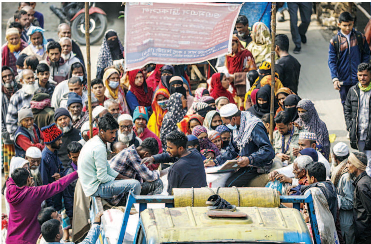
People queue up behind an OMS truck of the food department to buy rice and flour at subsidised prices at Basila intersection in Dhaka's Mohammadpur yesterday. They had to wait for about two hours before being able to purchase the essentials. Some, however, tried to bribe the outlet staffers to cut the line.