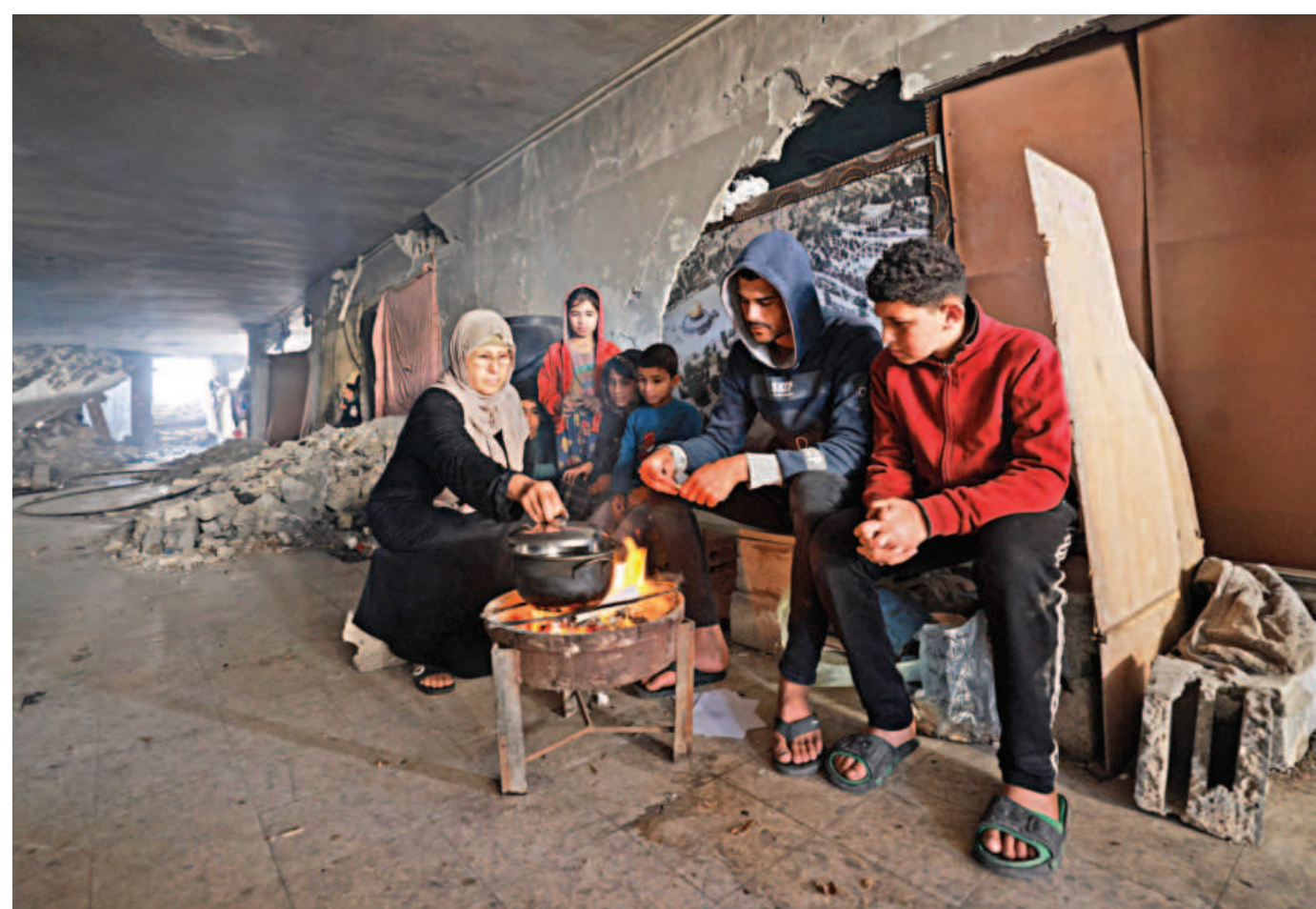
Displaced Palestinians prepare food as they take shelter inside a building damaged during Israeli bombardment in Rafah in the southern Gaza Strip yesterday.

London Gate purchased the plot of land in Dubai Marina, which already had the beginnings of an unfinished 106-storey structure - and knew that the tower's monumental size needed a striking facade, said Tom Hill, media relations coordinator for the developer.