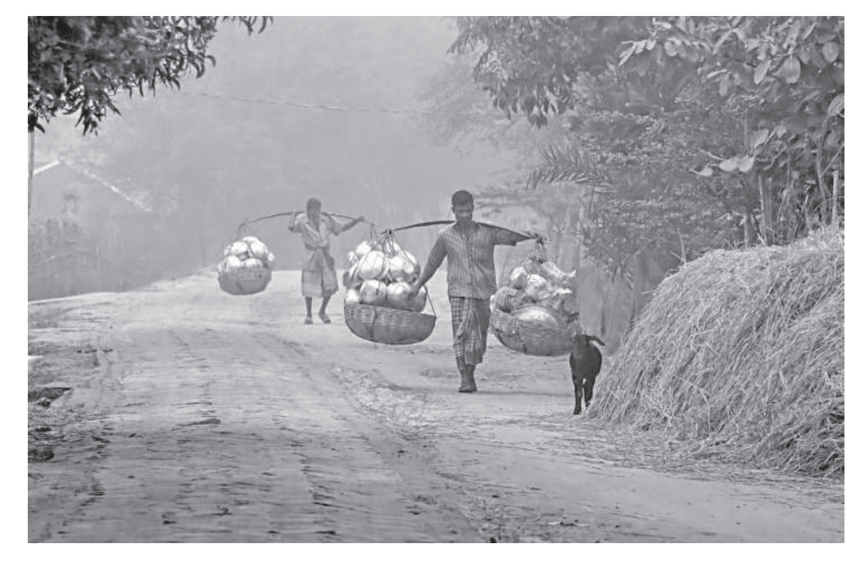
With heaps of cooking pots and other utensils loaded onto their shoulders, two hawkers walk on an earthen road amid dense fog in Khulna's Dakop upazila yesterday morning. They roam villages from dawn till dusk and sell the utensils for Tk 400-450 a kilo to households.