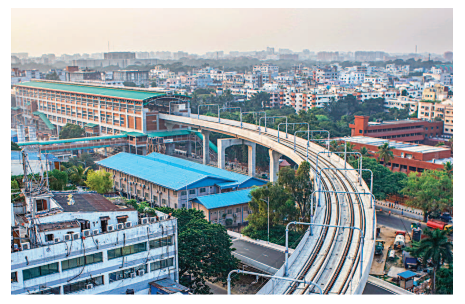
Not so long ago, the strip beneath the MRT line used to be Anwara Park, crowded with visitors, especially children. However, the only open space in Farmgate now remains occupied under the buildings with blue rooftop. While locals and DNCC demand the place be restored to its original form, the metro authorities plan to turn it into a station plaza.

The country's lowest temperature yesterday was recorded at 9.4 degrees Celsius in Bandarban.