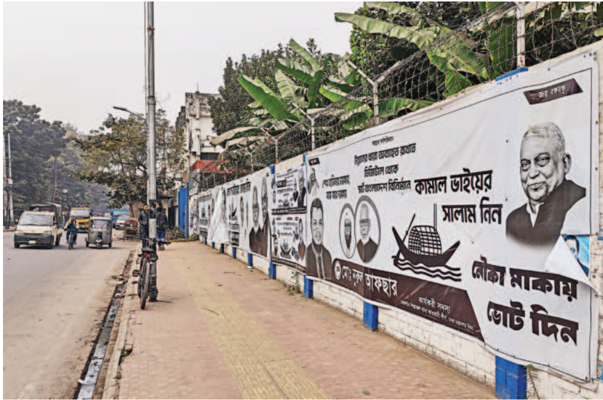
Eleven days have passed since the national polls, but the campaign posters and banners of many candidates are yet to be removed from Dhaka. The photo was taken near the Tejgaon Colony Bazar yesterday.