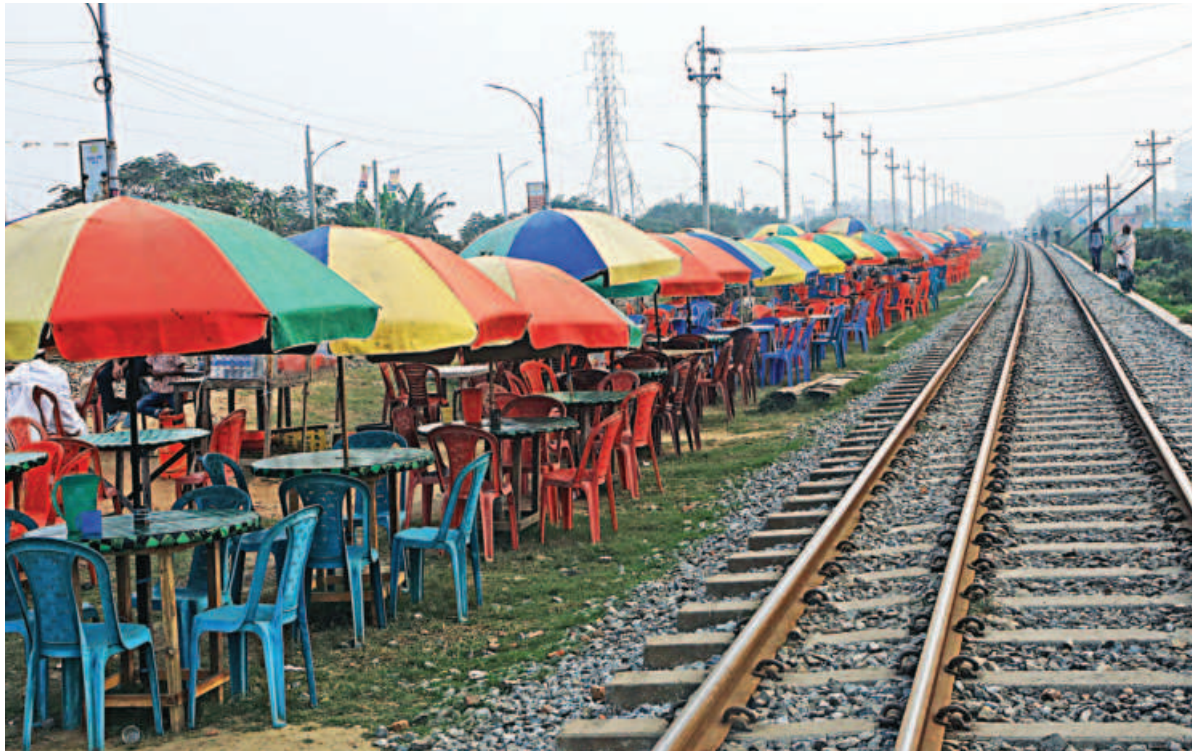
Showing a blatant disregard for safety, traders set up makeshift eateries between two rail lines (one not in frame) in Tongi's Hyderabad area. The eateries, which open in the afternoon, attract a lot of youths in the evening. The photo was taken on Monday.

BB aims to bring down inflation to 7.5pc by June