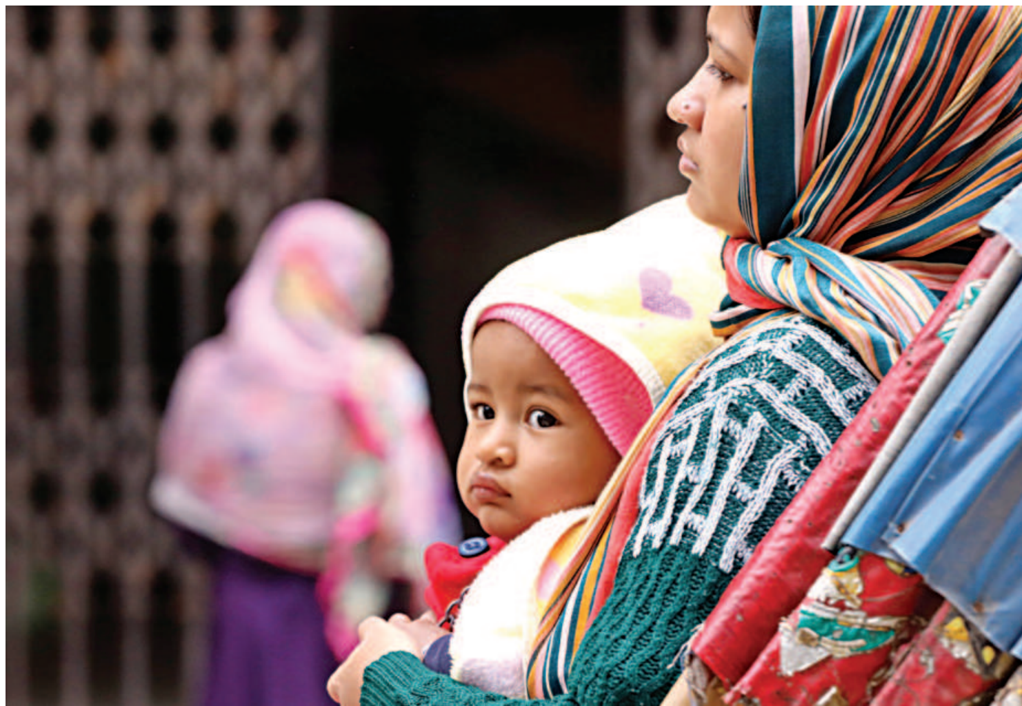
With a child in her lap, a guardian travels on a rickshaw in the cold morning at the capital's Mohammadpur yesterday. People, particularly children and the elderly, are facing difficulties amid the cold wave sweeping over the country.