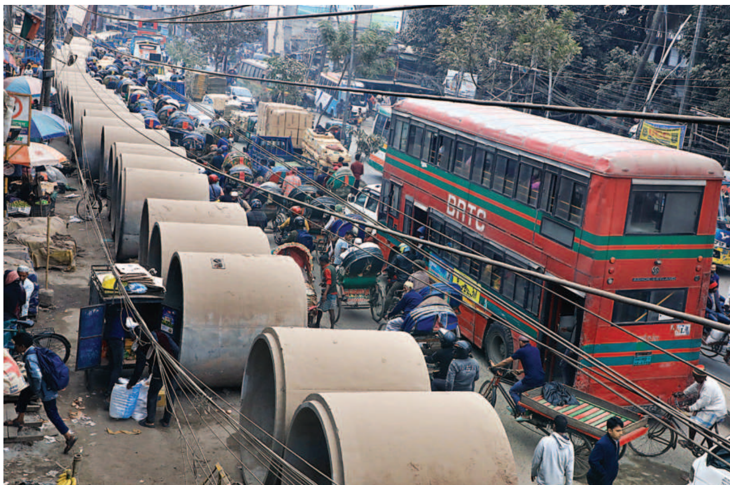
Commuters in the capital have been battling severe congestion on the Naya Bazar main road for almost a month now as a row of bulky sewer pipes occupy a significant portion of the road. Dhaka South City Corporation haphazardly left the pipes on the side of the road for underground sewerage work.

On the evening of January 15, the ship anchored at the Bhairab ghat in Bhatpara area.