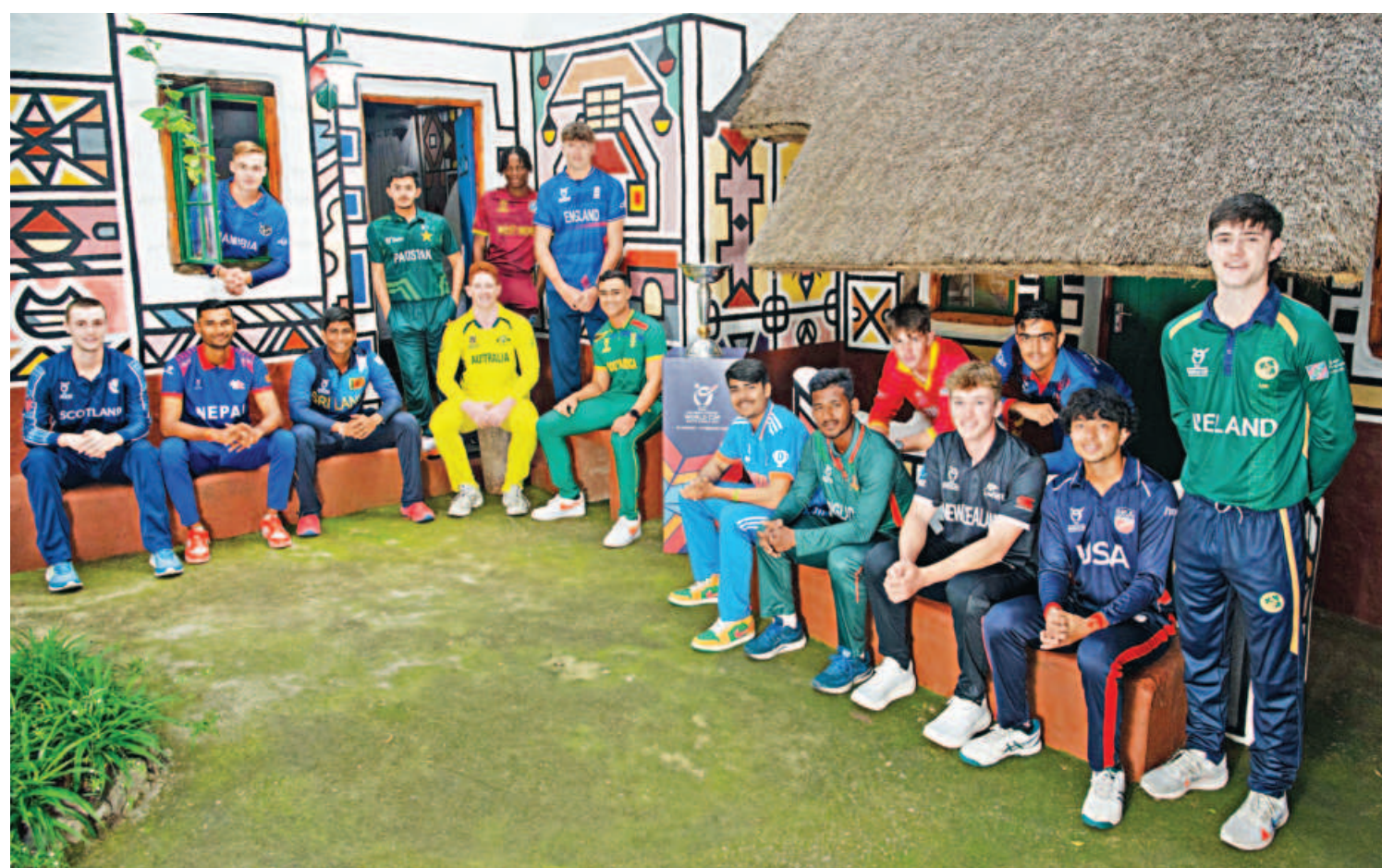
Ahead of the start of the 15th edition of the ICC U-19 World Cup on January 19, captains of all 16 participating teams met for a traditional photoshoot also known as Captains' Day. All the teams have been divided into four groups of four. Bangladesh, India, Ireland and USA make up Group A, while Group B consists of England, Scotland, South Africa and West Indies. Group C features Australia, Namibia, Sri Lanka and Zimbabwe while Group D includes Afghanistan, Nepal, New Zealand and Pakistan.

**Read the full stories on The Daily Star website