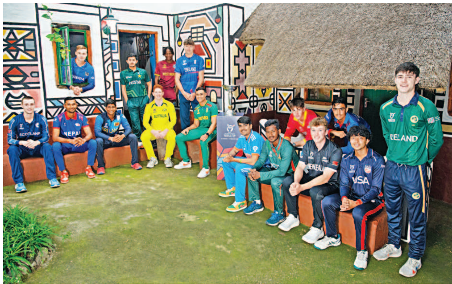
Ahead of the start of the 15th edition of the ICC U-19 World Cup on January 19, captains of all 16 participating teams met for a traditional photoshoot also known as Captains' Day. All the teams have been divided into four groups of four. Bangladesh, India, Ireland and USA make up Group A, while Group B consists of England, Scotland, South Africa and West Indies. Group C features Australia, Namibia, Sri Lanka and Zimbabwe while Group D includes Afghanistan, Nepal, New Zealand and Pakistan.