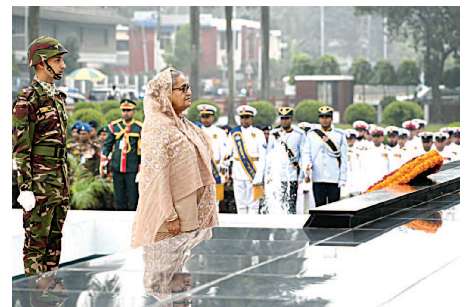
Prime Minister Sheikh Hasina pays tribute to the martyrs of the Bangladesh Armed Forces who laid down their lives during the nation's 1971 Liberation War. The tribute took place at the flame eternal, Shikha Anirban, located in the Dhaka Cantonment, yesterday.