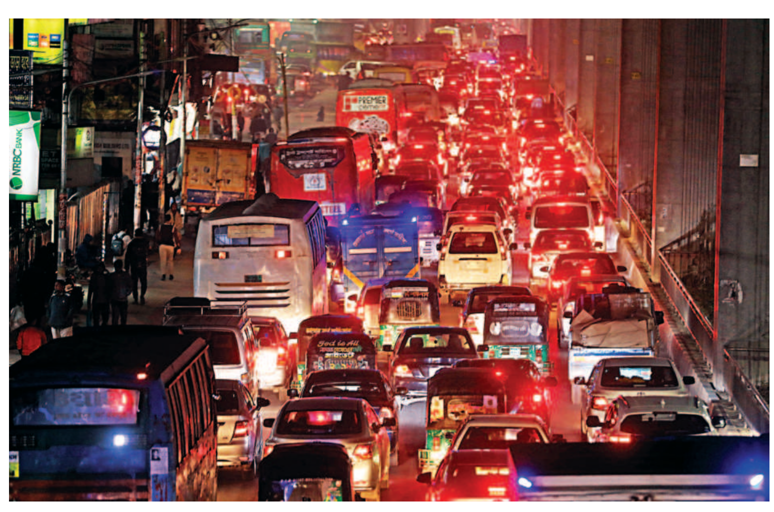
Vehicles stand motionless, forming a tailback, on Kazi Nazrul Islam Avenue in the capital yesterday. Dhaka witnessed noticeably heavy traffic throughout the day due to VIP movement, schools and many travelling to and from the city. The photo was taken in Karwan Bazar area in the evening.