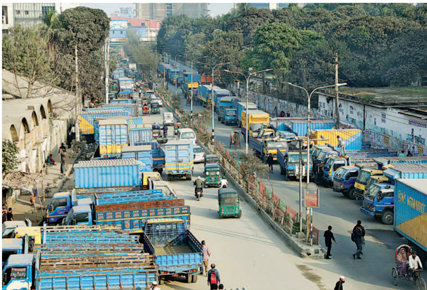
Lorries and trucks parked on the street between Saat Rasta and Tejgaon level-crossing have left little room for traffic to move. At peak hours, the illegal parking causes long tailbacks and makes commuters suffer.