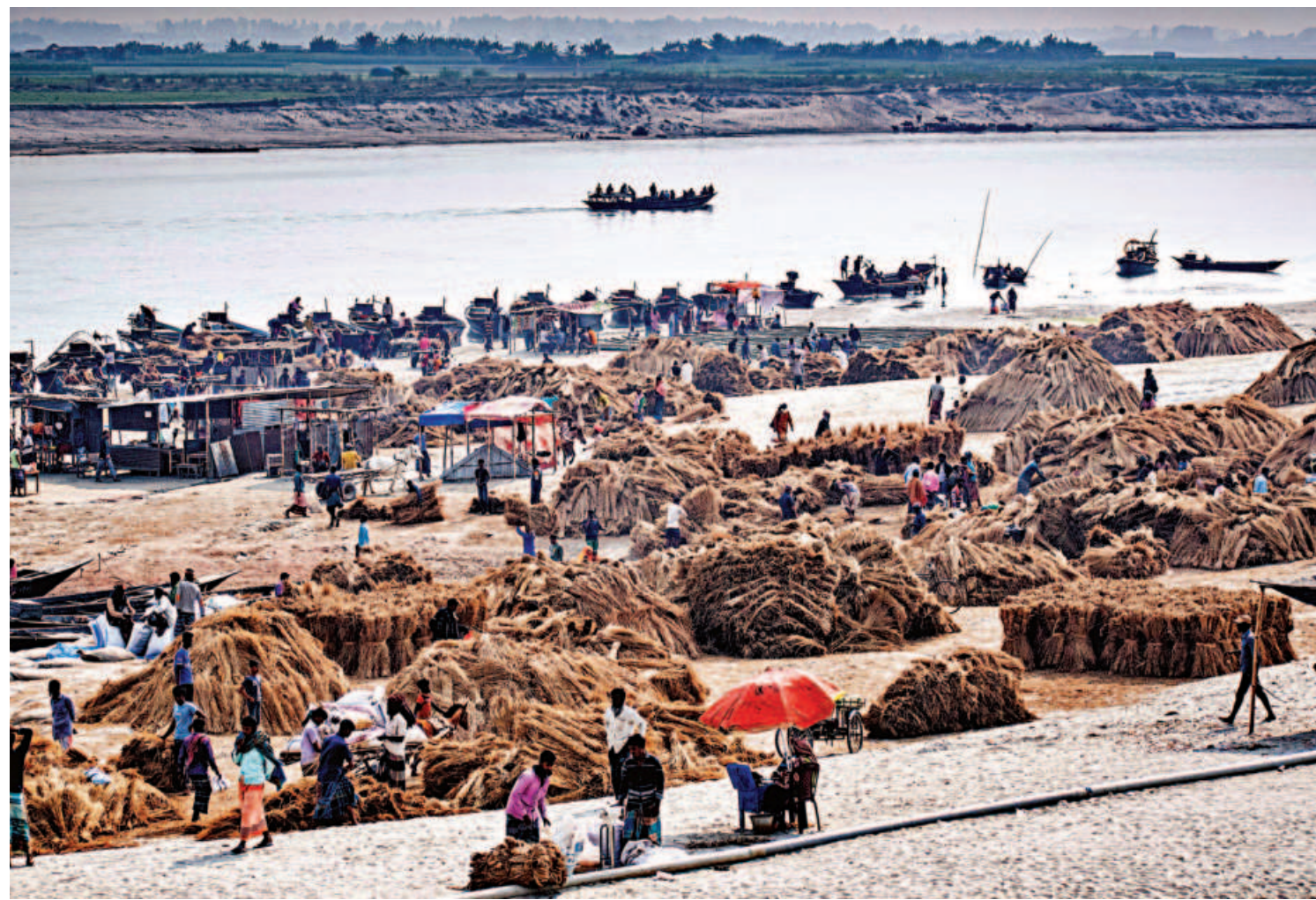
People from more than 30 small islands on the Jamuna travel to this place in Phulchhari, Gaibandha, twice every week to sell their produce and buy essentials. They either travel by boats or horse-drawn carts.