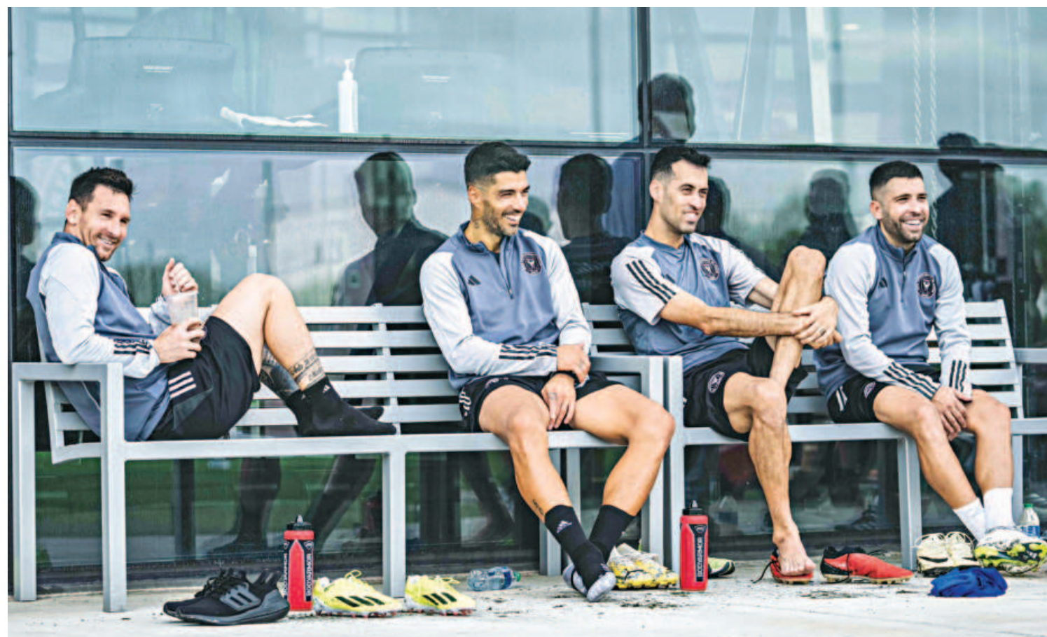
Four familiar faces -- Lionel Messi, Luis Suarez, Sergio Busquets, and Jordi Alba -- albeit in different colours, were all present during the year's first training session for Inter Miami on Saturday, invoking a sense of nostalgia for those who have been used to seeing this group play for Barcelona in the past decade. While Busquets and Alba joined Inter Miami in the MLS last season, this was the first time that Suarez took the field alongside Messi since both last played together for the Catalan giants before the Uruguayan left in 2020, signing for Atletico Madrid.