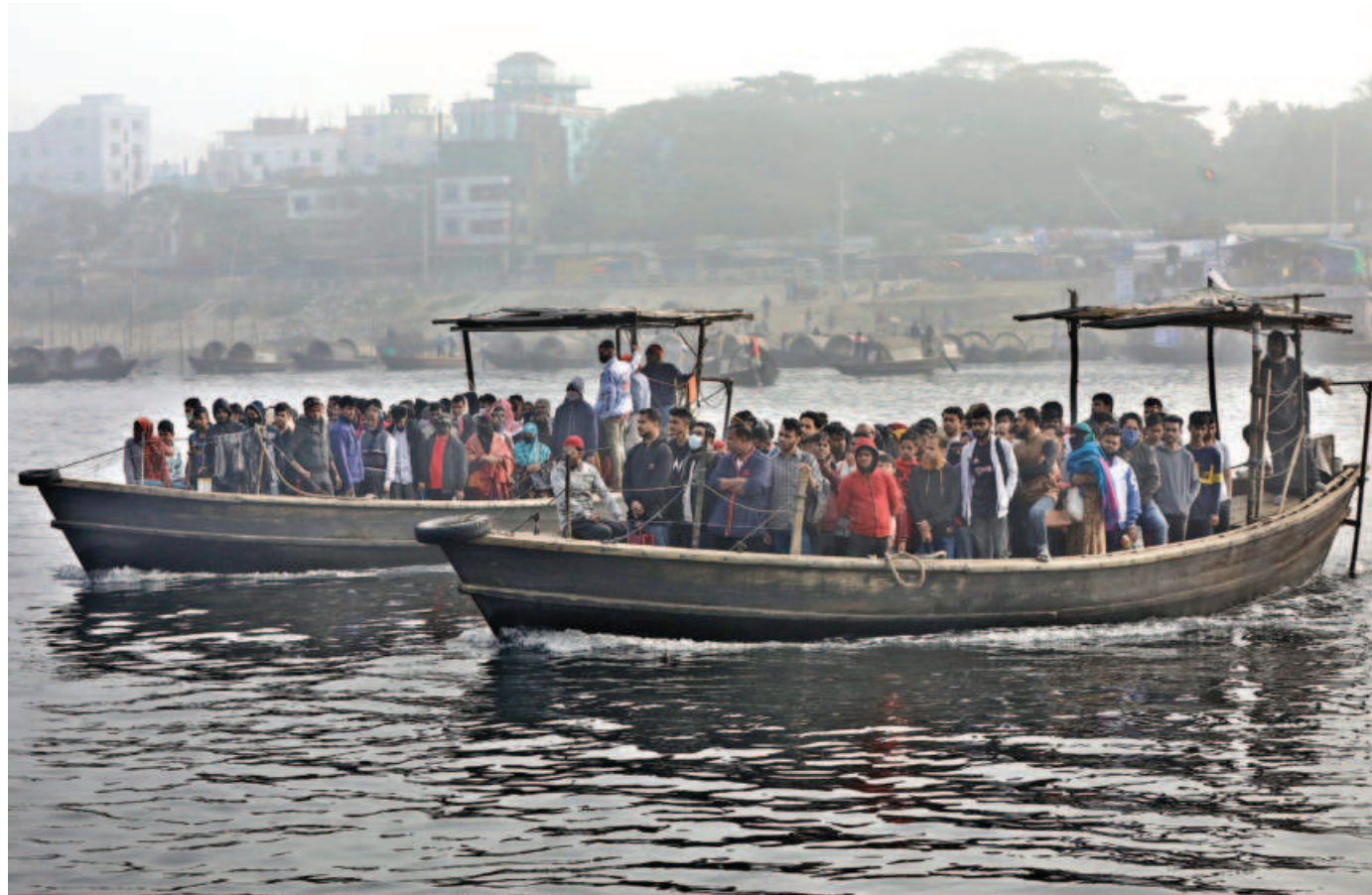
Every morning, thousands of people gather at Narayanganj's Central Kheya Ghat to cross the Shitalakkhya and get to Bandarghat on the other side. Risking their lives, hundreds gather on a single boat while having to remain cautious and alert for the entire journey. Locals say a bridge over the river, connecting the two sides, would relieve them of their daily ordeal. The photo was taken yesterday.

Apart from this, the ministry of local government, SEE PAGE 6 COL 3