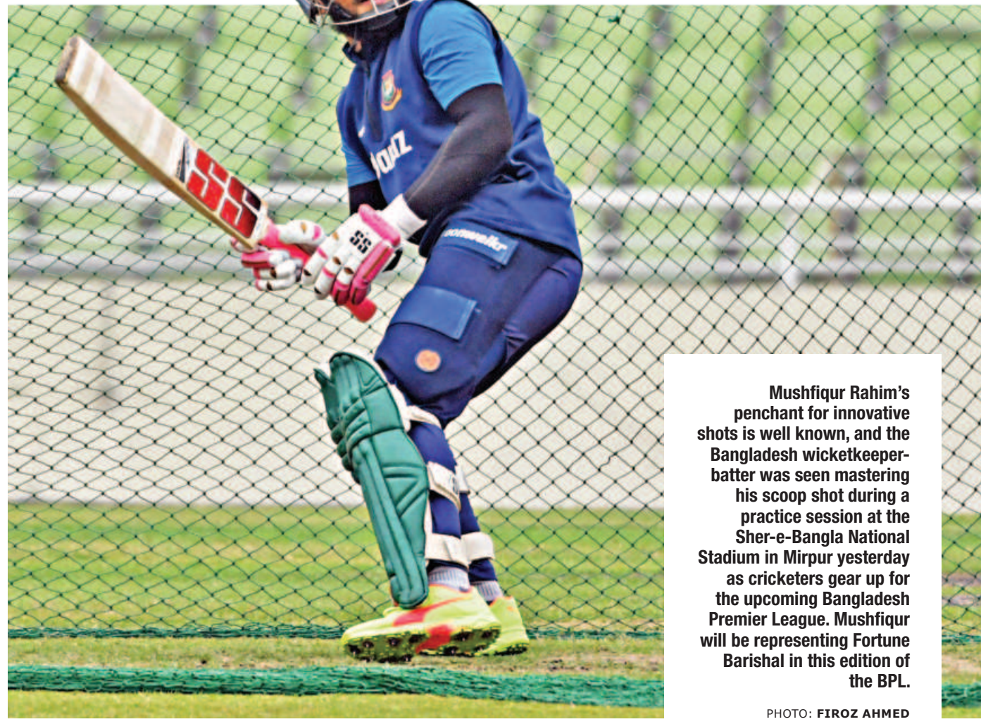
Mushfiqur Rahim's penchant for innovative shots is well known, and the Bangladesh wicketkeeper-batter was seen mastering his scoop shot during a practice session at the Sher-e-Bangla National Stadium in Mirpur yesterday as cricketers gear up for the upcoming Bangladesh Premier League. Mushfiqur will be representing Fortune Barishal in this edition of the BPL.

As people continue to speculate regarding Papon's tenure and the next president of the country's most followed sporting federation, Non-Striker's End, The Daily Star's digital cricket show, attempts to answer all these questions.