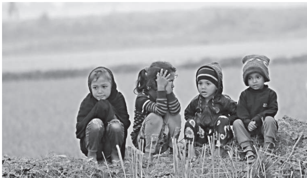
Covering themselves in warm clothes, four children wait for the sun to peek out from the foggy skies yesterday morning. The photo was taken in Sunamganj's Jhawbazara area.