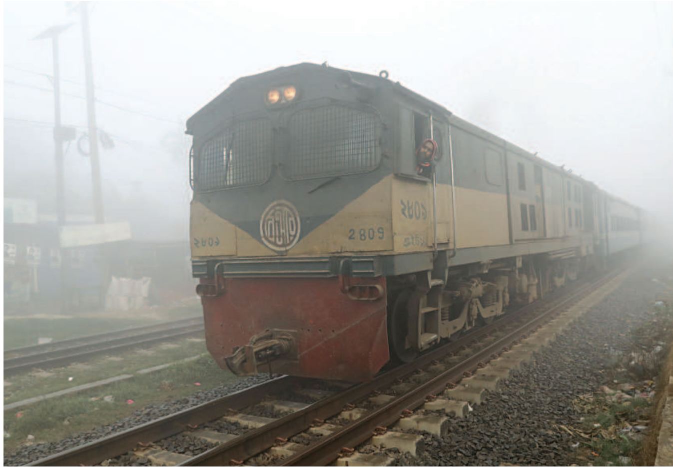
A train driver peeks out of his window in the locomotive for a better view of the tracks ahead early yesterday. With winter raging on, the density of fog occurring across the country, especially in the early hours, has further intensified, disrupting the navigation of all modes of transportation.