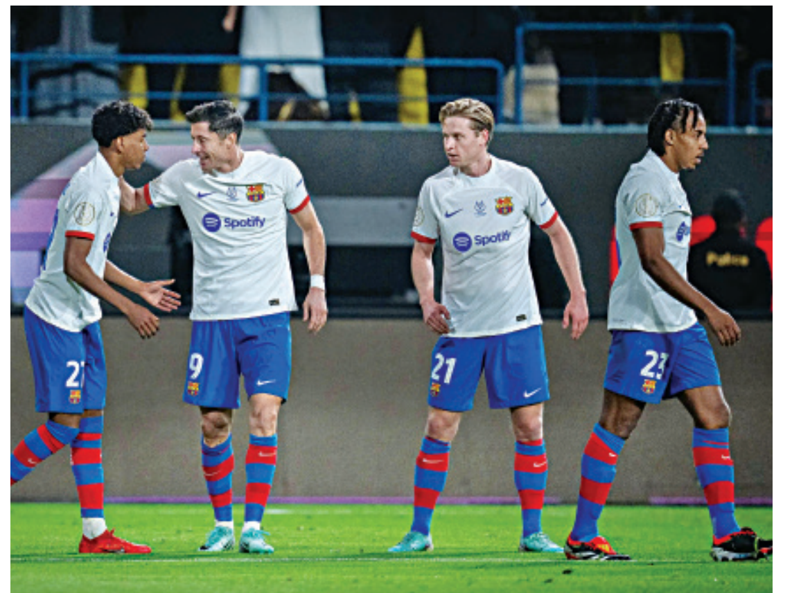
Reigning champions Barcelona advanced to the final of the Spanish Super Cup following a hard-earned 2-0 victory against Osasuna at the Al-Awwal Park Stadium in Riyadh yesterday (Bangladesh time), courtesy of second-half goals from Robert Lewandowski and Lamine Yamal. The win sets up a high-voltage El Clasico on Sunday (1:00 am on Monday, Bangladesh time) with Real Madrid having inflicted a 5-3 defeat to Atletico Madrid in the first semifinals of the competition.

"They are the team to beat, their record in recent seasons has been incredible. They have the best manager in the world, their style of play is difficult to combat, but I believe we can really compete in this game," he said.