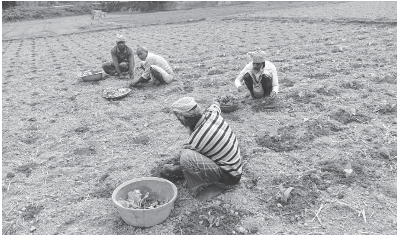
Farmers planting tobacco seedlings across new lands in Lalmonirhat to expand the yield from the previous year. Despite the risks of long-term damage to soil and the environment, farmers are going for tobacco production to gain more profits, with incentives from six tobacco companies. The photos were taken recently.