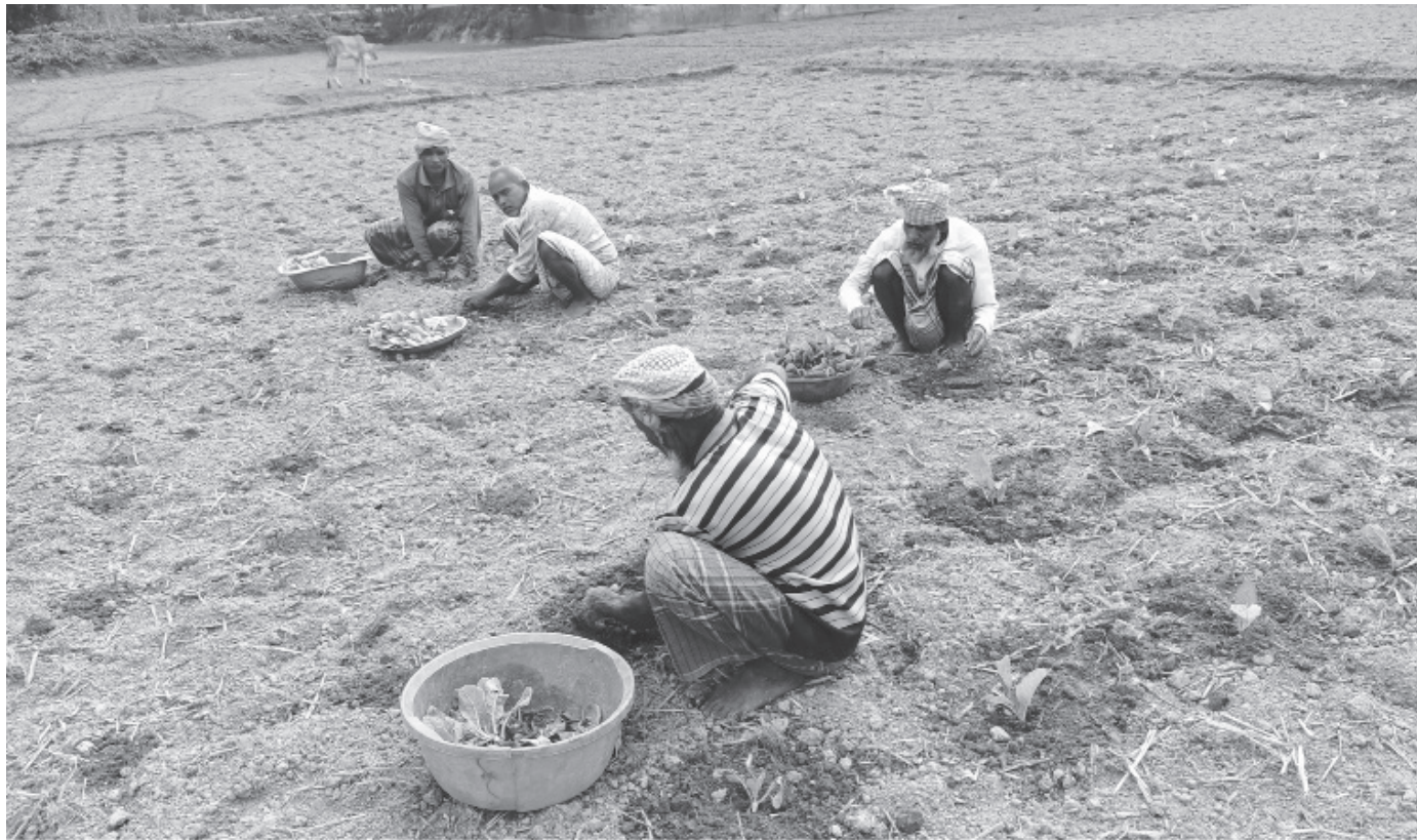
Farmers planting tobacco seedlings across new lands in Lalmonirhat to expand the yield from the previous year. Despite the risks of long-term damage to soil and the environment, farmers are going for tobacco production to gain more profits, with incentives from six tobacco companies. The photos were taken recently.