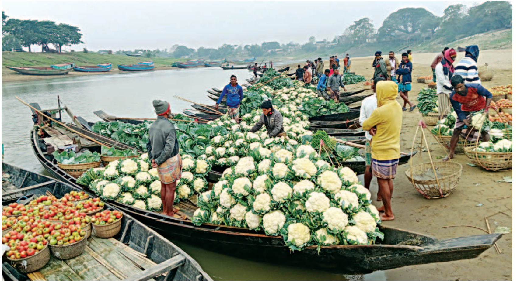
Vegetables brought from nearby villages are being unloaded from boats in Sylhet's Kanaighat Char Bazar on Wednesday. Growers sold each 100 cauliflowers for Tk 4,000 to Tk 6,000, depending on the size. Prices of winter vegetables remain relatively high in the kitchen markets for what traders say is a supply dearth owing to reduced production. Story on page 12