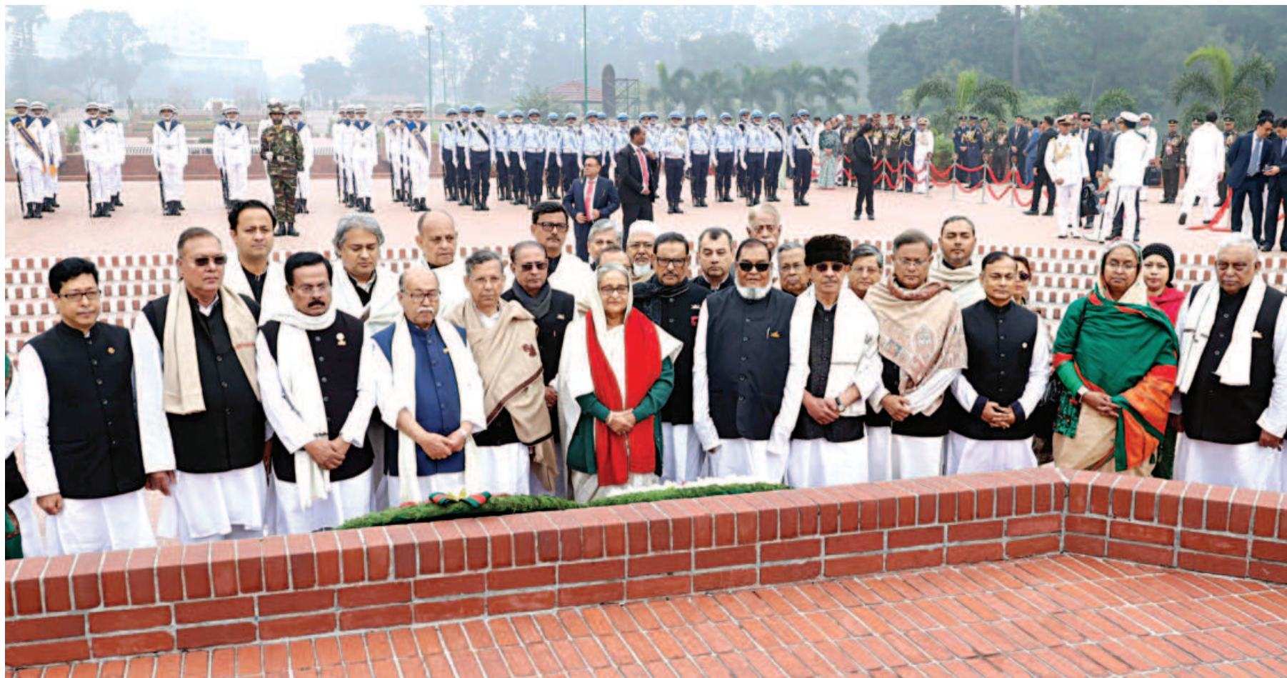
Flanked by members of the council of ministers, Prime Minister Sheikh Hasina stands in solemn silence after placing wreaths at the National Memorial in Savar. They visited the memorial yesterday, a day after taking their oath of office, to pay homage to the martyrs of the Liberation War.