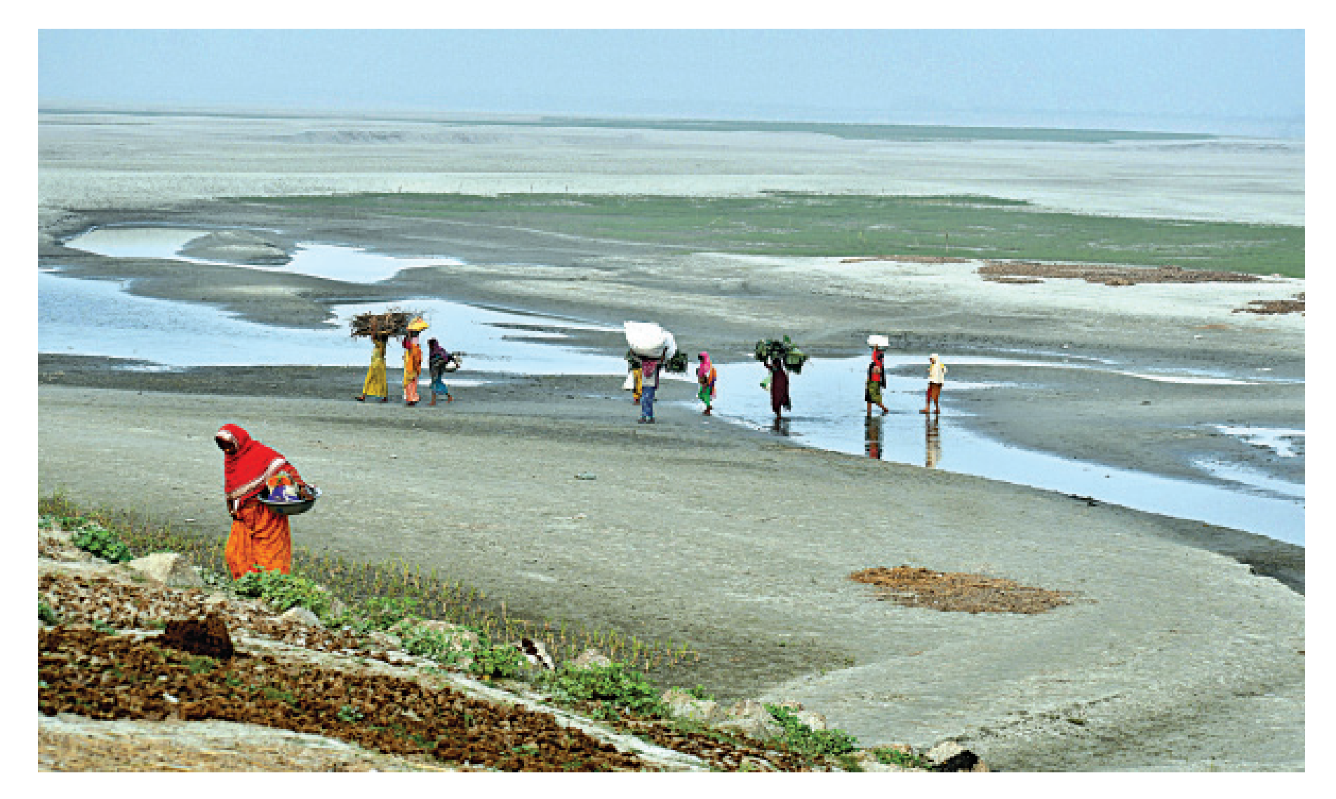
Char residents in Hatsherpur area in Bogra's Shariakandi upazila have to walk across the Jamuna in the dry season, due to a lack of transport with the exception of horse carts, as the water level goes down almost entirely. During monsoon, the river widens up to 10-14km and the locals can use boats to move across. The photo was taken