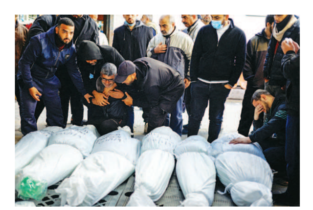
Relatives mourn next to the bodies of Palestinians killed in an Israeli strike in Rafah, in the southern Gaza Strip, yesterday.

The researchers made the discovery using a set of computer simulations that replicated the size and properties of the vast radio rings, including cool gas that had been found in the centre of the galaxy at their middle.