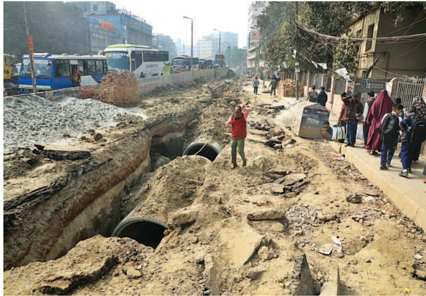
A part of the road approaching Babubazar bridge in the capital's Nayabazar has been in this sorry state for weeks as the authorities are installing sewer pipes. The deep, open trench poses a risk to road users.