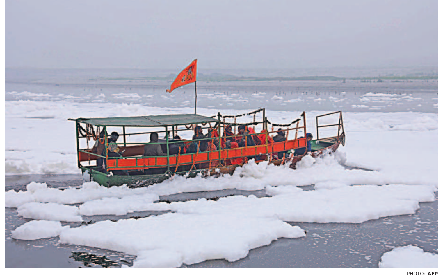
People ride a boat in the polluted Yamuna river laden with foam during a cold winter morning in Mathura of Uttar Pradesh, India yesterday.

China had previously announced the satellite launch and did not offer any details on its flight plan. China made two satellite launches on consecutive days in early December from a launch site in Inner Mongolia.