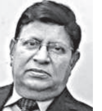
SEE PAGE 4 COL 1

"I thought we should have a get together. It's a lovely weather. So, please meet and greet. Nothing else," he added.