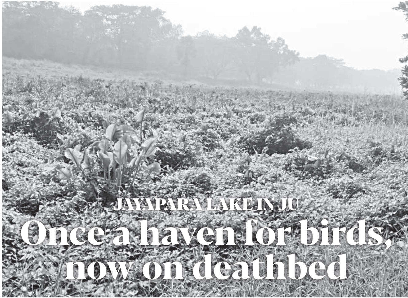
JAYAPARA LAKE IN JU

The cause of the fire is so far unknown.