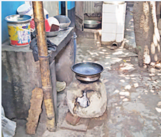
An earthen stove inside a house in a Mirpur slum.