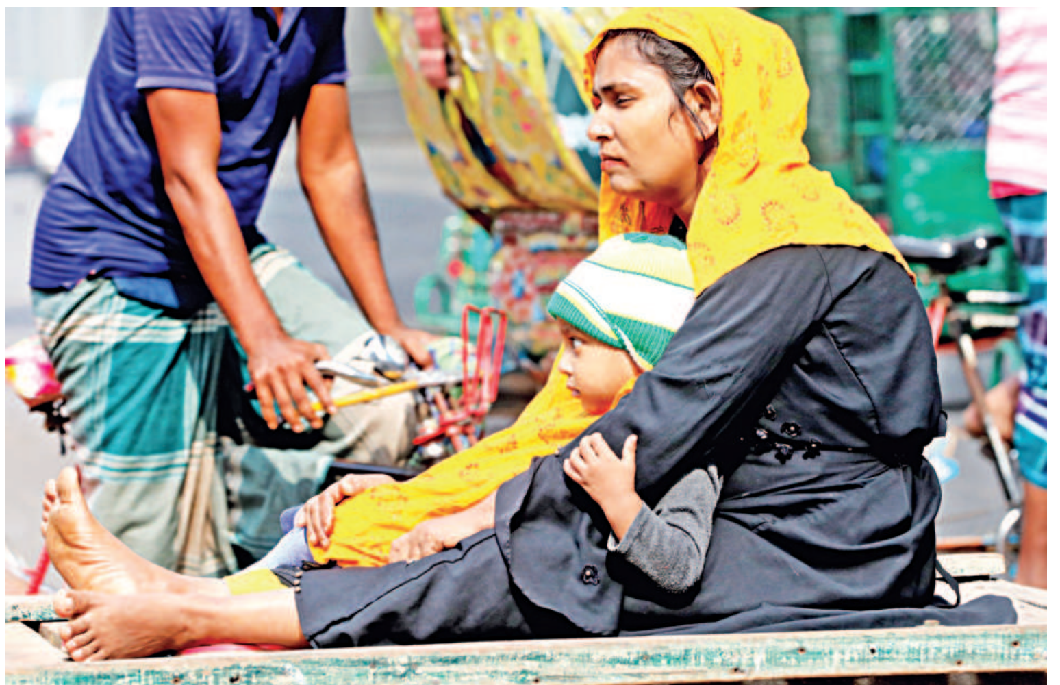
Wrapping her arms around, a mother shelters her son from cold breezes as they ride a rickshaw-van. The photo was taken recently at the capital's Banglamotor intersection.