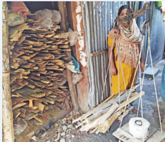
A woman buying firewood near a slum in Mirpur. She said she buys per kilogramme of firewood for Tk 15.