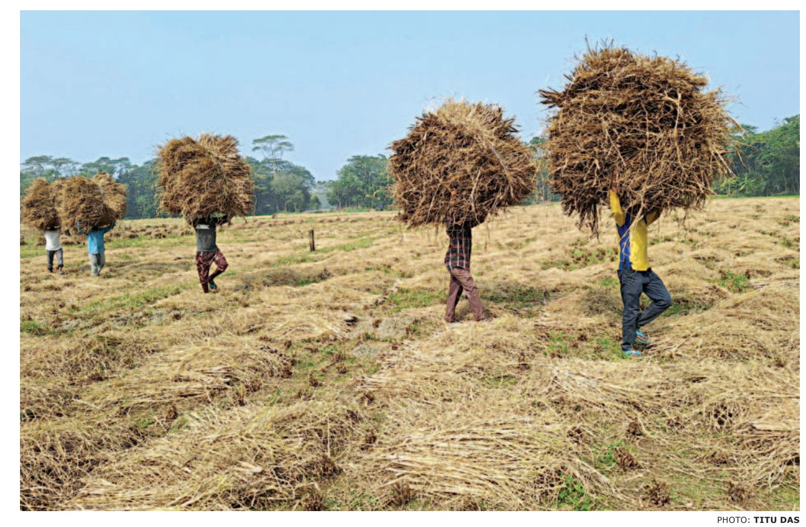
Farmers in Barishal Sadar upazila's Karapur village yesterday began clearing out the rice straws from paddy fields after the harvest of Aman. Once all the straws are collected, they will be sold as cattle feed for livestock.