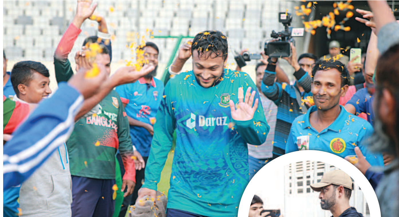
With just over a week left for the start of the Bangladesh Premier League, Bangladesh skipper Shakib Al Hasan was not the one to waste any more time. The ace all-rounder was congratulated by the groundstaff as he arrived at the Sher-e-Bangla National Stadium for practice yesterday, just a day after winning from the Magura-1 constituency in the national elections. [Inset] Meanwhile, Tamim Iqbal was among a few other cricketers who also trained in Mirpur on Monday.