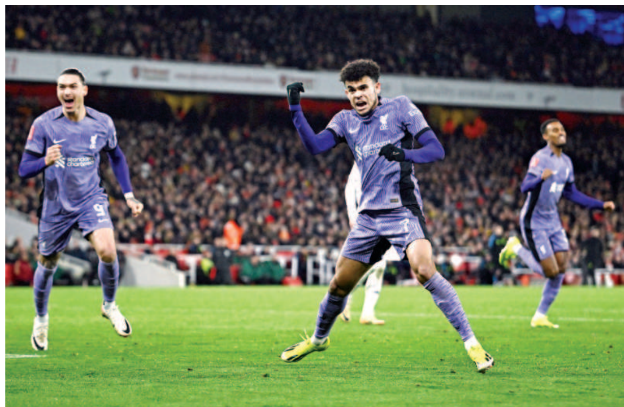
Premier League leaders Liverpool secured a 2-0 win over Arsenal in their FA Cup third-round encounter at the Emirates Stadium yesterday. The Reds, who also cemented a place in the semi-final of the League Cup, qualified for the fourth round of the competition having displayed solid bench strength as they came into the contest with as many as eight absentees, including star forward Mohamed Salah and skipper Virgil van Dijk. Juergen Klopp's side took the lead late in the game by virtue of an own goal by Arsenal defender Jakub Kiwior in the 85th minute before winger Luis Diaz doubled the score five minutes into stoppage time.

"He has been busy for the last few weeks but now since he is free, he will focus on strengthening his finger. Since a substantial amount of pain has gone away so if he works on those things, he will be alright ahead of the BPL."