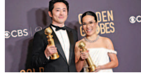
Ali Wong and Steve Yeun win Best Actress and Actor in Limited TV Series, for 'Beef'.