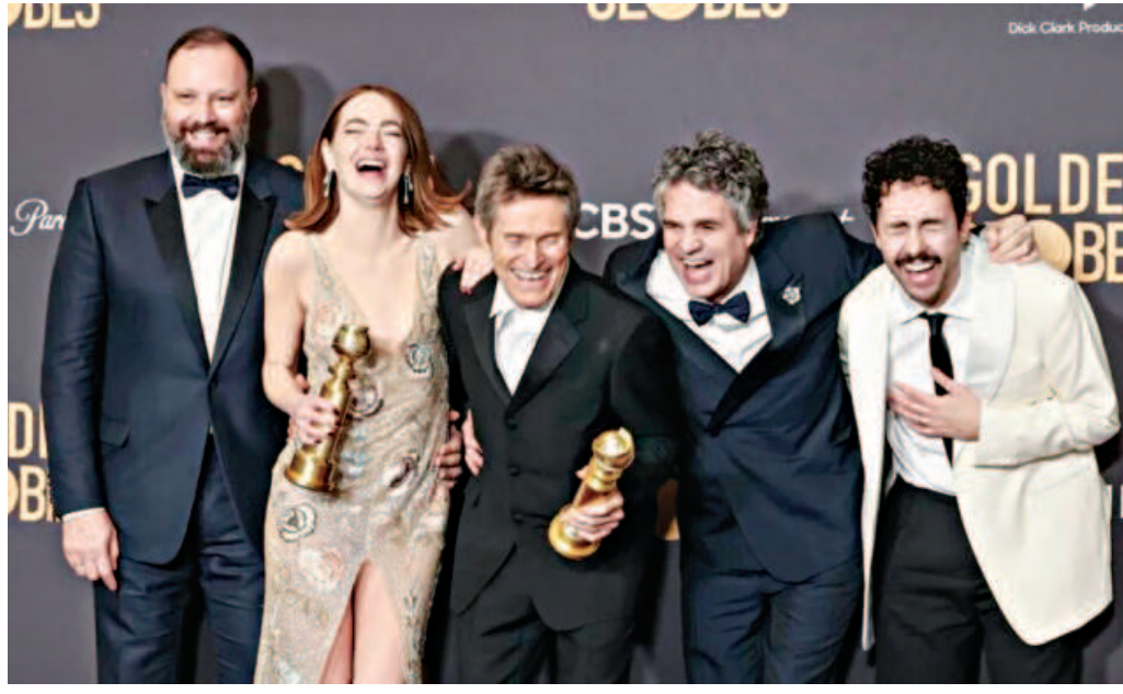
'Poor Things' clinches major awards, including the Best Movie Musical or Comedy.