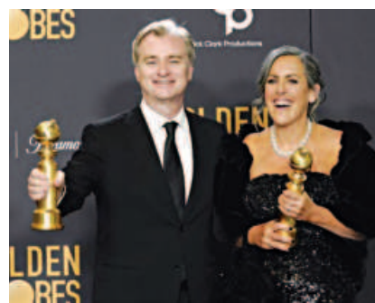
Christopher Nolan secures Best Director in Motion Picture for 'Oppenheimer'.

Noteworthy individual achievements also coloured the evening, as Ali Wong and Steve Yeun secured Golden Globes for Best Actress and Actor in a Limited TV Series, respectively, for their exceptional performances in Netflix's Beef . Their victories etched history,