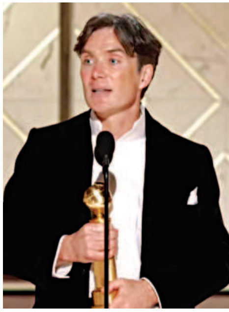
Cillian Murphy wins Best Actor in Motion Picture, Drama for 'Oppenheimer'.