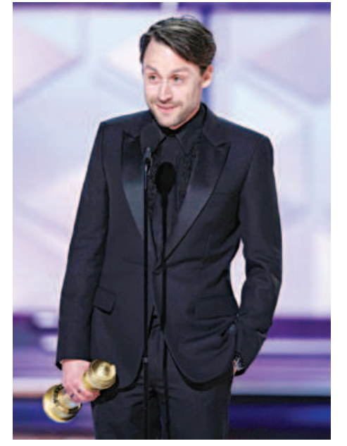
Kieran Culkin secures Best Actor in TV Series, Drama, for 'Succession'.