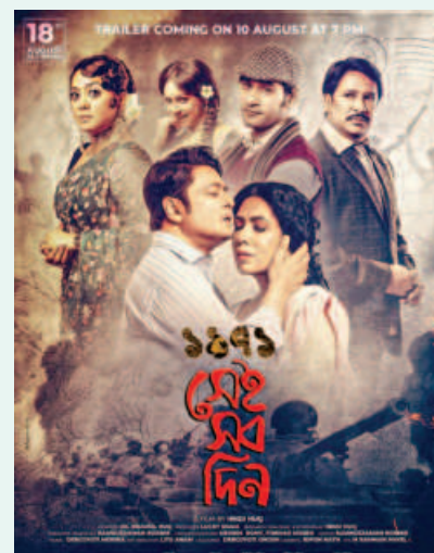
1971 Shei Shob Din