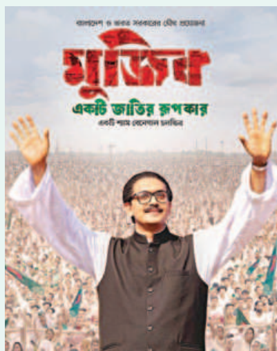
Mujib: The Making of a Nation