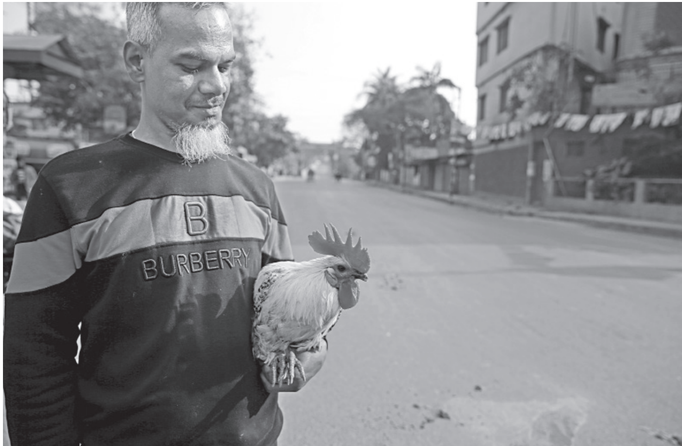
After waiting for an hour for a bus, this elderly person decided to walk back home with his chicken yesterday afternoon. Due to the national polls and ongoing hartal called by BNP in protest, very few buses plied the city streets. The photo was taken in Tikatuli area.