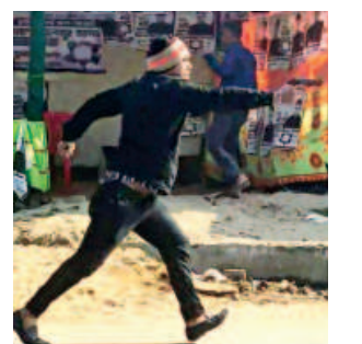
This man brandishing a gun during a clash near a polling centre in Ctg's Khulshi.