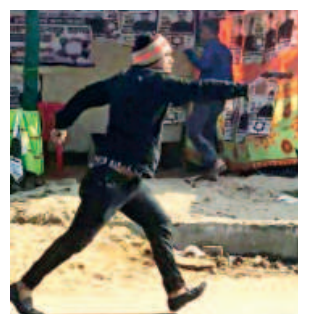
This man brandishing a gun during a clash near a polling centre in Ctg's Khulshi.