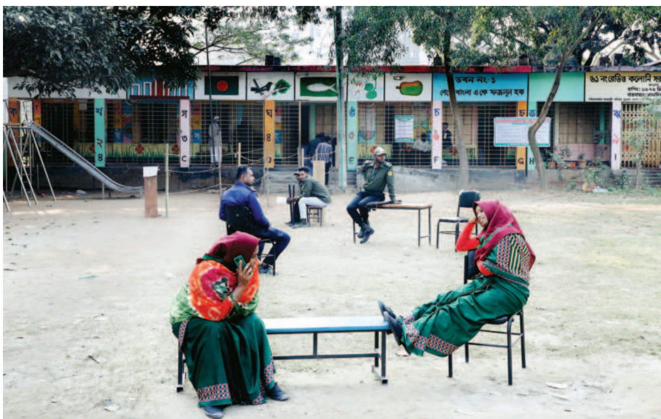
Two female poll clerks were engaged in chitchat while, right behind them, an Ansar man and police official were lounging at Savar's Radio Colony School and College polling centre due to a lack of voters yesterday. The photo was taken at 2:30pm, an hour and half before voting officially ended.