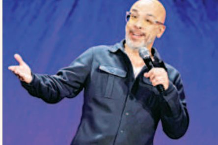
Golden Globes host Jo Koy

The subsequent fallout led to boycotts, the refusal by NBC to air the 2022 ceremony, and a series of reforms within the HFPA. In a groundbreaking move, billionaire Todd Boehly took over and reinvented the Golden