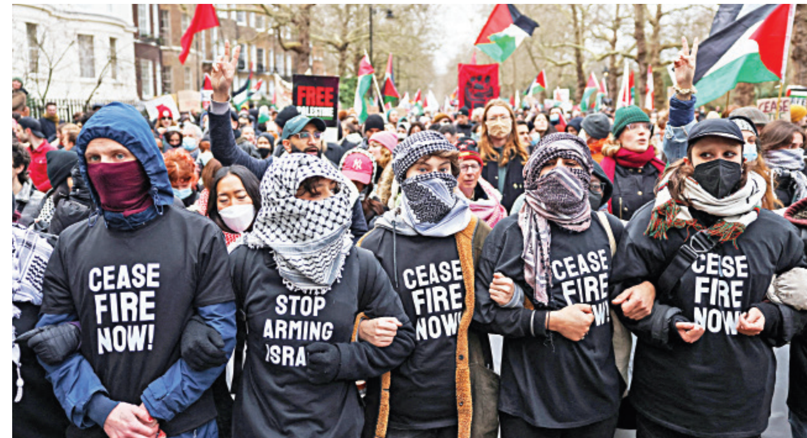
People take part in a protest in solidarity with Palestinians in Gaza in London, Britain yesterday.

If required, the voting in a particular constituency or a polling centre will be postponed, he said.