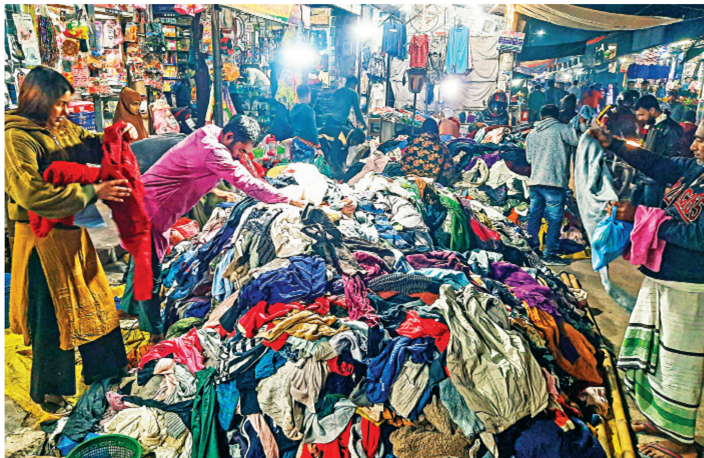
People thronging the Railway Market in Khulna city to stock up on sweaters, jackets, gloves and more amid the ongoing moderate cold wave sweeping across the country. According to the Met, the temperature is expected to dip further over the next five days. The photo was taken recently.

Actor Ferdous Ahmed is contesting the polls on AL ticket from the seat.