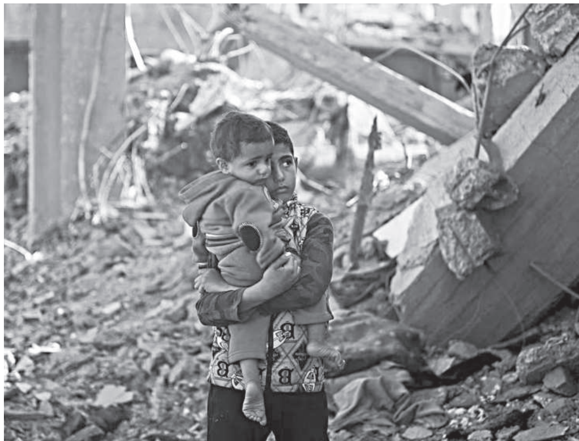
Even after the deaths of nearly 22,000 Palestinians since October 7, there is no sign of let-up in Israeli offensives.

We don't have to sugar-coat reality with metaphors. The stone slab on a child is real. The bare hands of a father and a brother are not enough to free him. If we are to move towards 2024, we need more people to lend a hand. But to join hands, we must first pull the bait out of our mouths.