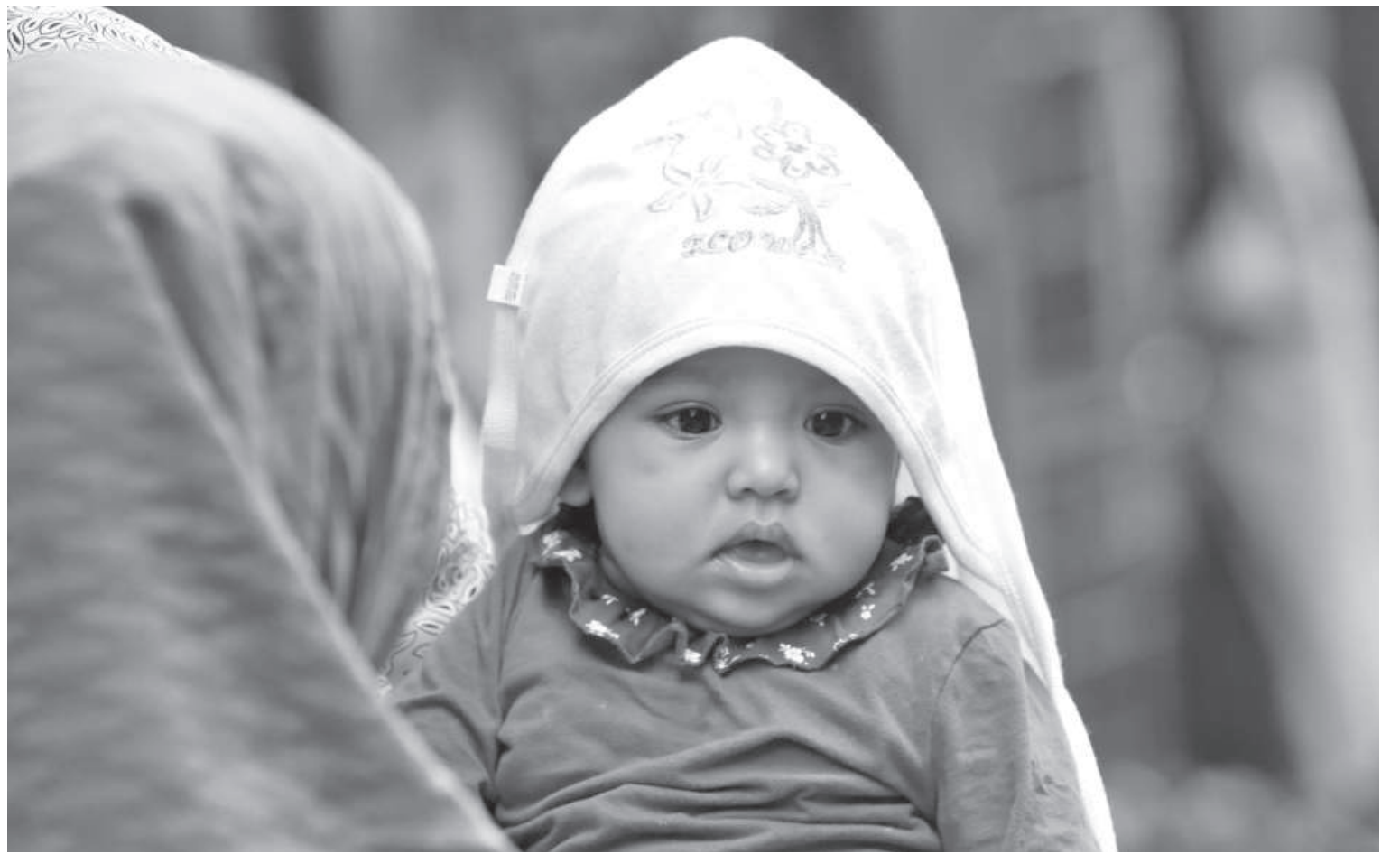
Donning a hoodie, a toddler sets off to the capital's Purbo Tejturi Bazar kitchen market with her mother on the last morning of the year. Her eyes gaze upon colourful vegetables and other items while her mother gets busy bargaining with vendors yesterday.

This correspondent also tried to reach several local leaders of BNP there, but found their phones switched off.