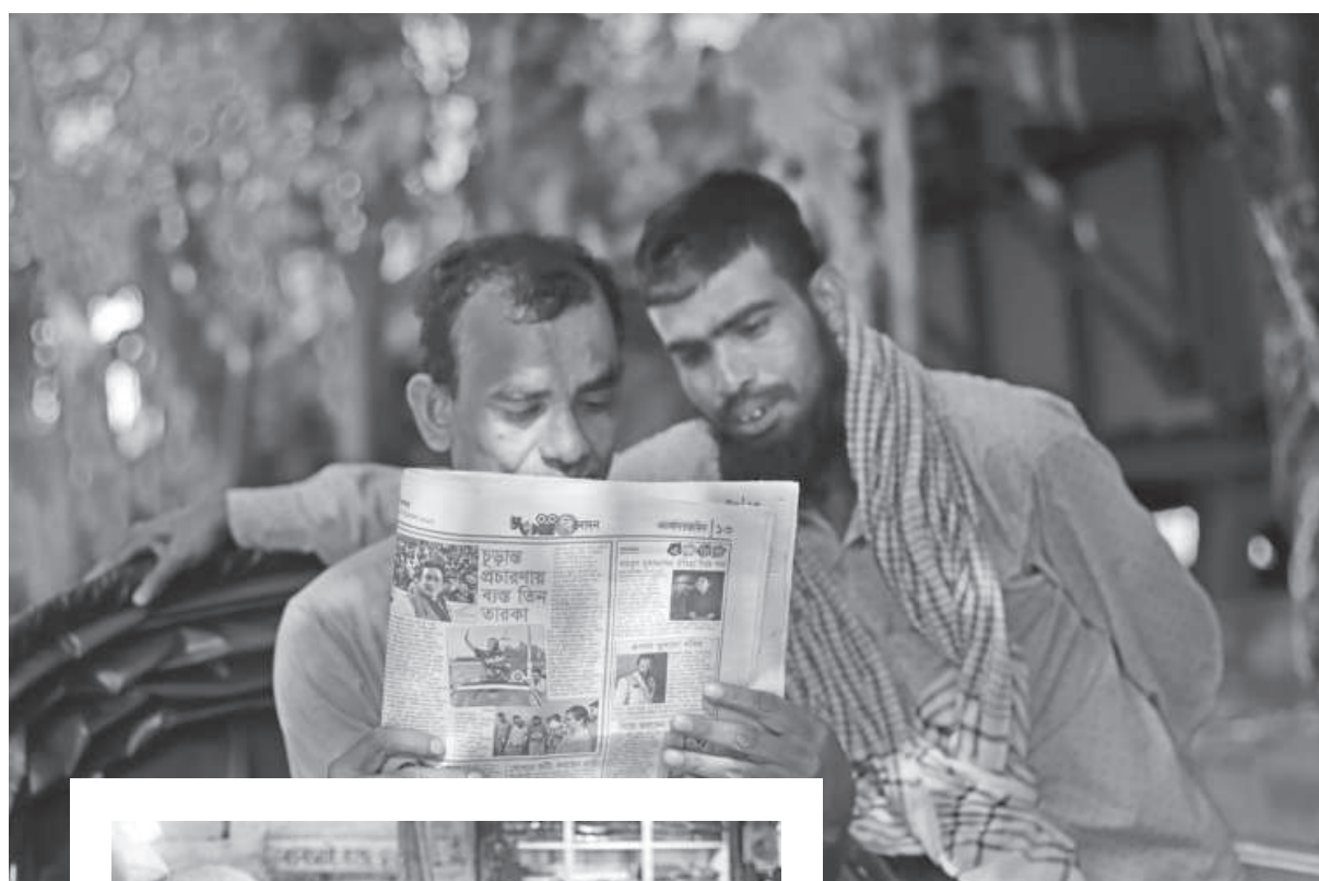
Two rickshaw-pullers in Sylhet's Circuit House area turn to newspaper headlines to catch up on nationwide events, specifically focusing on the upcoming election. Meanwhile, in a tea stall at Jafong, inset, three elderly friends engage in animated discussions about candidates in their locality. With the polls knocking at the door, scenes like these, involving people from diverse groups, have become common these days.