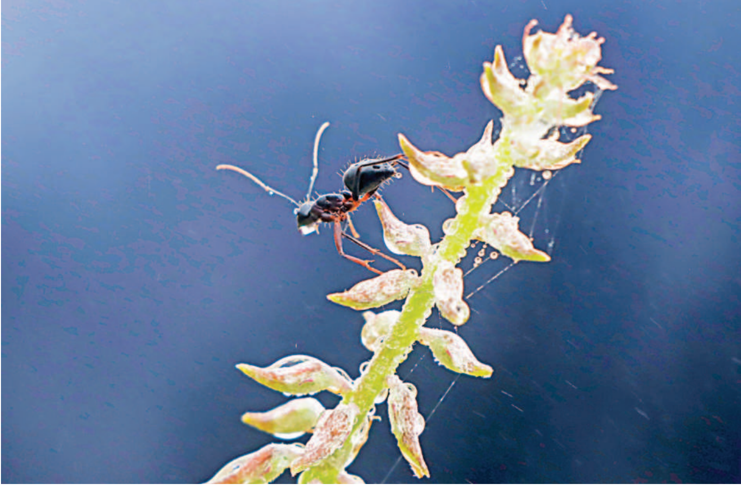
Gliding from one mist-drenched petal to another, a black ant sips dew droplets sparkling under the freshly risen sun in Khulna's Botiaghata upazila yesterday morning.