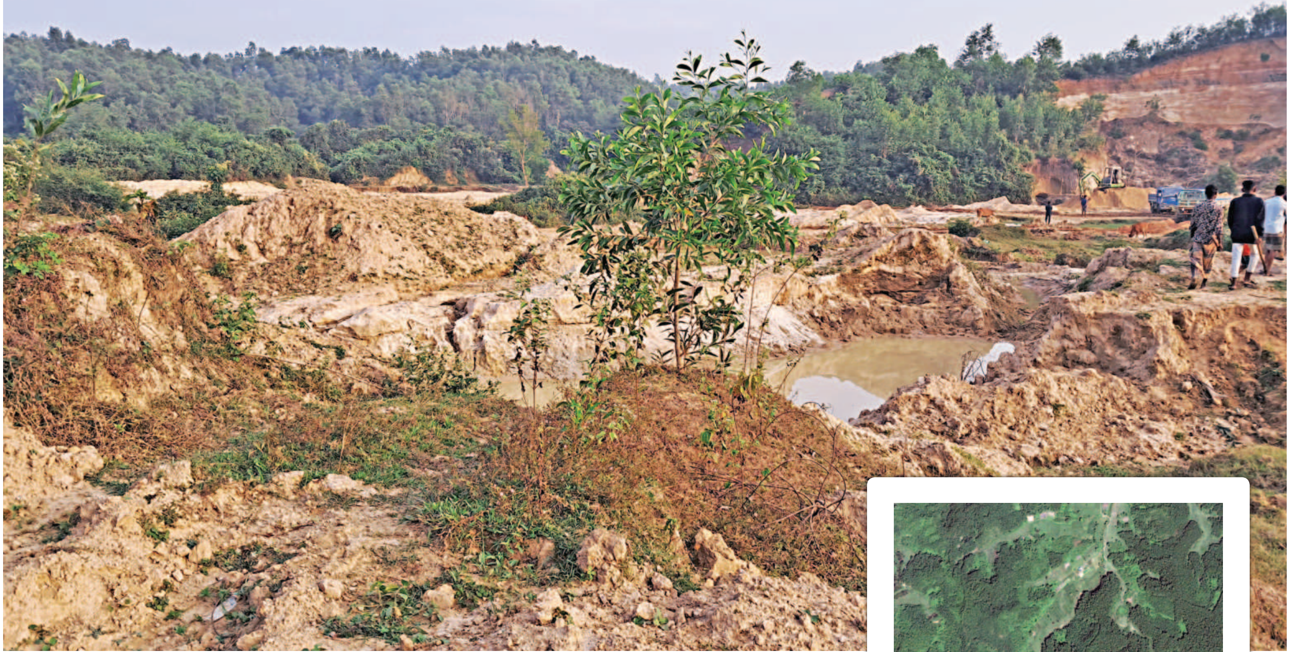
The sand lifters also destroyed at least seven hills and thousands of trees in the area.