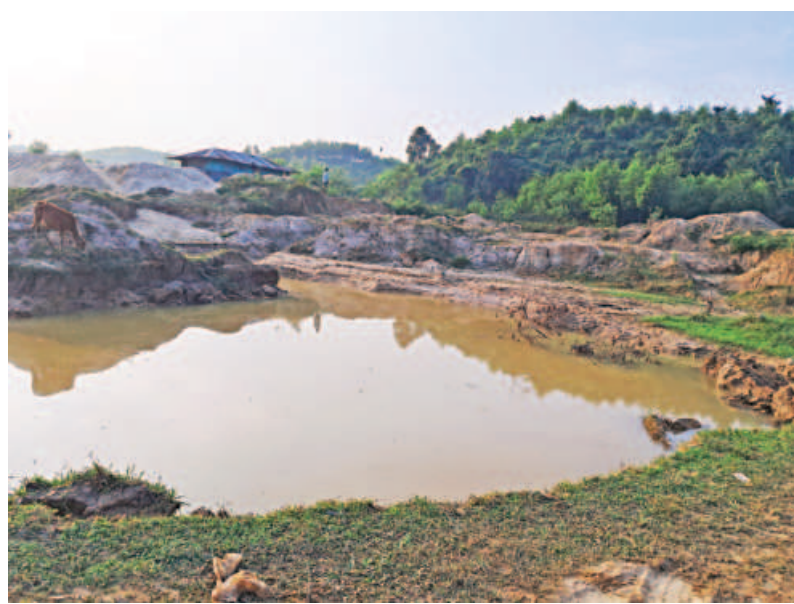
Visiting the area recently, this correspondent observed that a lake has been formed due to illegal sand lifting in the elephant habitat, along with at least 30 other large holes.

Visiting the area recently, this correspondent observed that a lake has been formed due to illegal sand lifting in the elephant habitat, along with at least 30 other large holes. The sand lifters also destroyed at least seven hills and thousands of trees in the area.