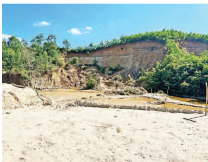
Once a natural ecosystem for elephants, the forest is gradually turning into a death trap for the endangered species due to unabated sand lifting.

"There is an urgent need to protect and augment the traditional elephant habitats to neutralise the rising trend of elephant-human conflicts, wherever feasible," he added.