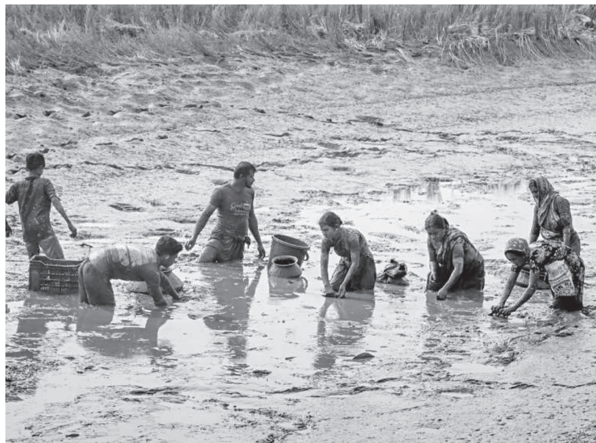
As water of local fish enclosures recedes during the winter, locals of Khulna's Dakope upazila go fishing. They extract the remaining water and turn the activity into a fun-filled family event. The photo was taken yesterday.