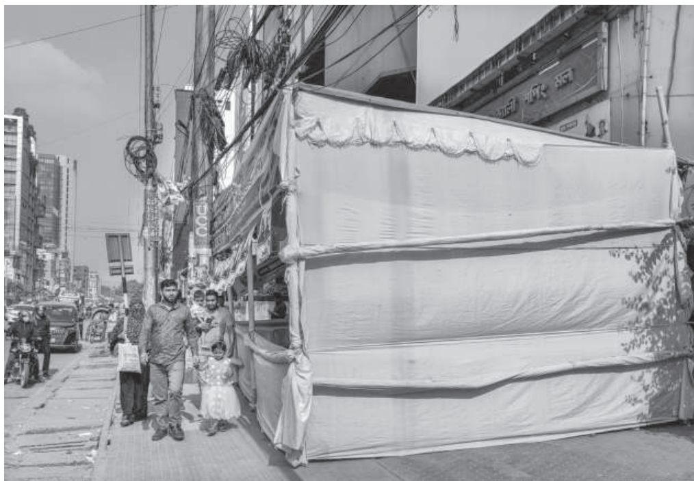
A makeshift campaign office of the Awami League candidate has been set up on the footpath in Uttar Badda area, obstructing pedestrians. The photo was taken yesterday.