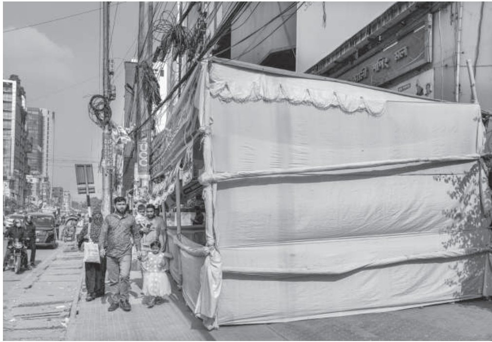
A makeshift campaign office of the Awami League candidate has been set up on the footpath in Uttar Badda area, obstructing pedestrians. The photo was taken yesterday.