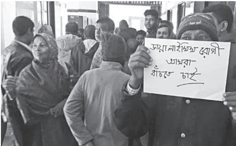
Protesting the increased costs of dialysis at M Abdur Rahim Medical College Hospital in Dinajpur, patients demonstrated at the hospital on Tuesday.

The cost of dialysis at M Abdur Rahim Medical College Hospital in Dinajpur surged due to a lack of supply of medical equipment and medicine, leaving at least 200 patients worried for their lives. According to hospital sources, the dialysis unit has around 41 dialysis machines, of which 29 are operational. Around 200 patients are registered there and take dialysis regularly. Protesting the situation, patients staged a protest on Tuesday at the hospital. Patients with acute kidney dysfunction in Dinajpur, Thakurgaon, Panchagarh and Nilphamari are solely reliant on this unit. Previously, the hospital would provide a majority of the accessories and medicine required for dialysis, such as dialysis filter, bloodline, IV saline, heparin injection, renal fluid A and B. In total, dialysis patients would pay Tk 1,200 for the service along with all of the medicine and accessories provided by the hospital. Speaking with patients, The Daily Star learned that the hospital authorities are now giving patients only saline worth Tk 20 and syringe worth Tk 7. As a result, dialysis patients are forced to spend an additional Tk 1,700 out of their pockets to procure all necessary medicine and accessories. This has resulted in