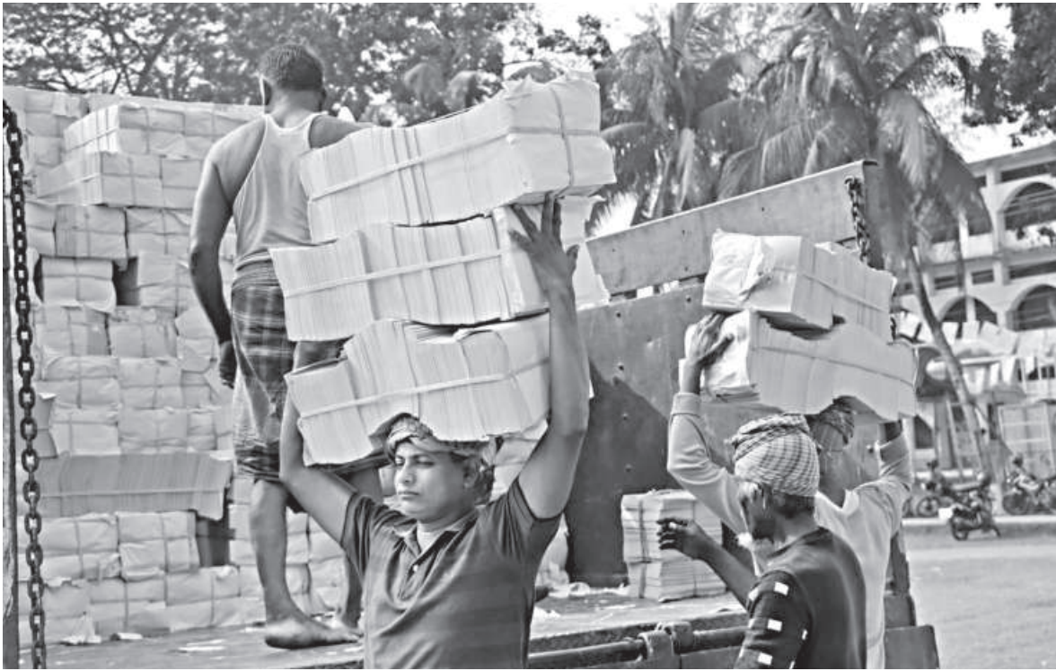
After receiving clearance from the Election Commission to hold the "textbook festival" on January 1, the government has already set things in motion. Trucks from Dhaka, carrying textbooks, reached Barishal's Bakerganj upazila yesterday and efforts are underway to distribute these books to different schools in the area. The photo was taken near Bakerganj Jibon Singha Union High School.

enforcement officials at Primary Teachers' Training Institute. "This time there can be no incident of muscle power during voting. If any, then the returning officers are directed to suspend the vote at the centres immediately. If the presiding officers notice this, they will also do it. If the presiding officer fails, then the RO will do it. If RO doesn't stop voting, then EC will take action directly," he said. He also asked the administration and law enforcers to act neutrally to make the polls acceptable to everyone. "Environment on the polling day will be discussed for a long time. To prevent vote rigging, the presiding and polling officers, who will conduct the voting, will have to ensure that no unauthorised person is allowed inside the centres during voting." The CEC urged the candidates for keeping polling agents at the centres so that they can see the empty ballot boxes before voting and be present during vote counting. A CMP deputy commissioner, wishing anonymity, said, "The CEC asked the police officials not to allow any unauthorised person inside voting booths or the polling centres, and also to record complaints immediately if there is any gross allegation or violence before and after voting."