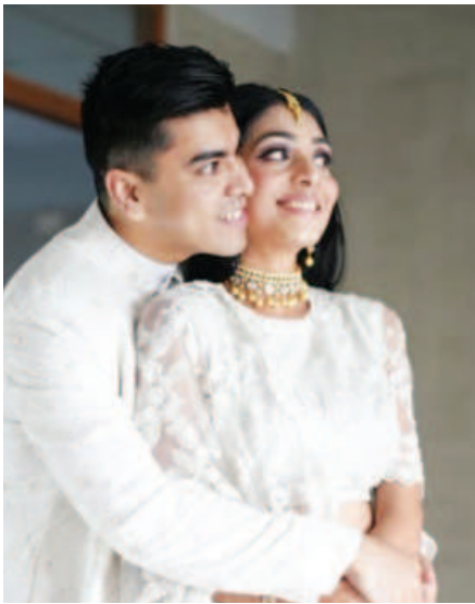
Salman and Disha

In 2023, quite a few celebrities in the entertainment industry tied the knot. Some got married suddenly, while others had publicly announced it. The headlines in the showbiz world have been dominated by these marriage stories.