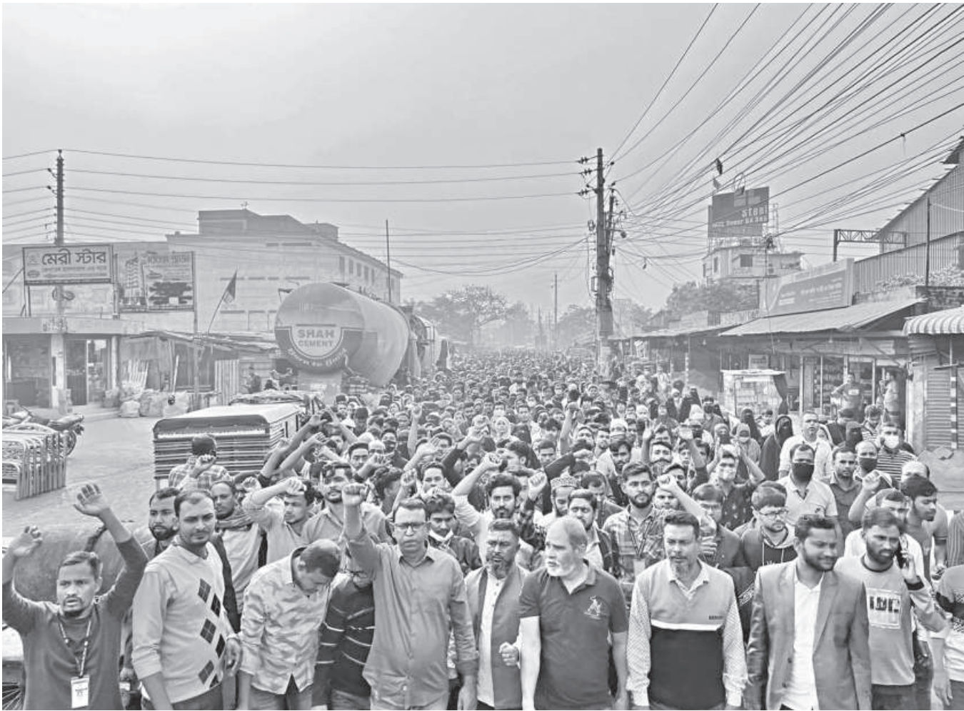
RMG workers bring out a procession on Dhaka-Munshiganj road yesterday morning, protesting the decision of Crony Tex Sweater Ltd to lay-off workers from the sweater division due to a decline in work orders.