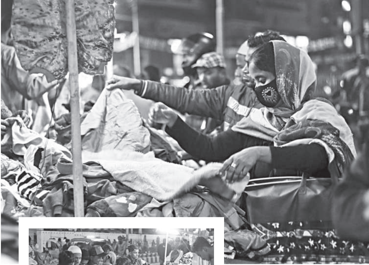
With temperatures continuing to drop across the country, residents of Sylhet are busy shopping for winter clothes. Even in the evening, these shops remain crowded, as they are an ideal spot to buy affordable winter wear. The photo was taken in the city's court area yesterday.