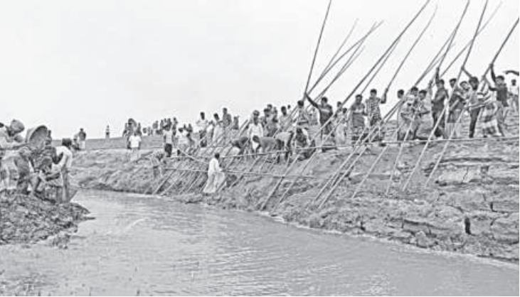
This file photo of last year shows floodwater flowing over an embankment and entering Gurmar Haor in Tahirpur upazila of Sunamganj. Due to heavy rains upstream, waters from swollen rivers in the Sylhet region have been causing floods.